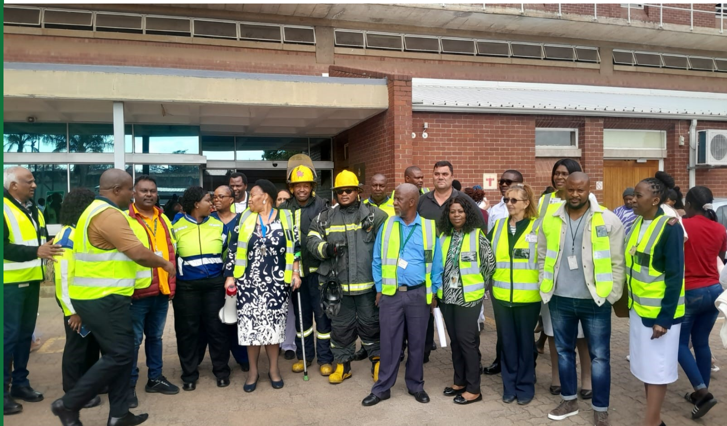
Pictured is Newcastle Fire Department together with the Newcastle Regional Hospital Disaster Committee after the hospital fire drill