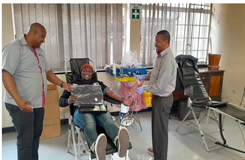
South African National Blood Services representatives attending to one of the patient who came to donate blood. The gentleman happened to be the winner of the day and received a nicely branded bag from SANBS.

Management at the hospital extended a heartfelt thank you to their staff who donated as well as the Public Relations Unit for ensuring that the donation process went smoothly.