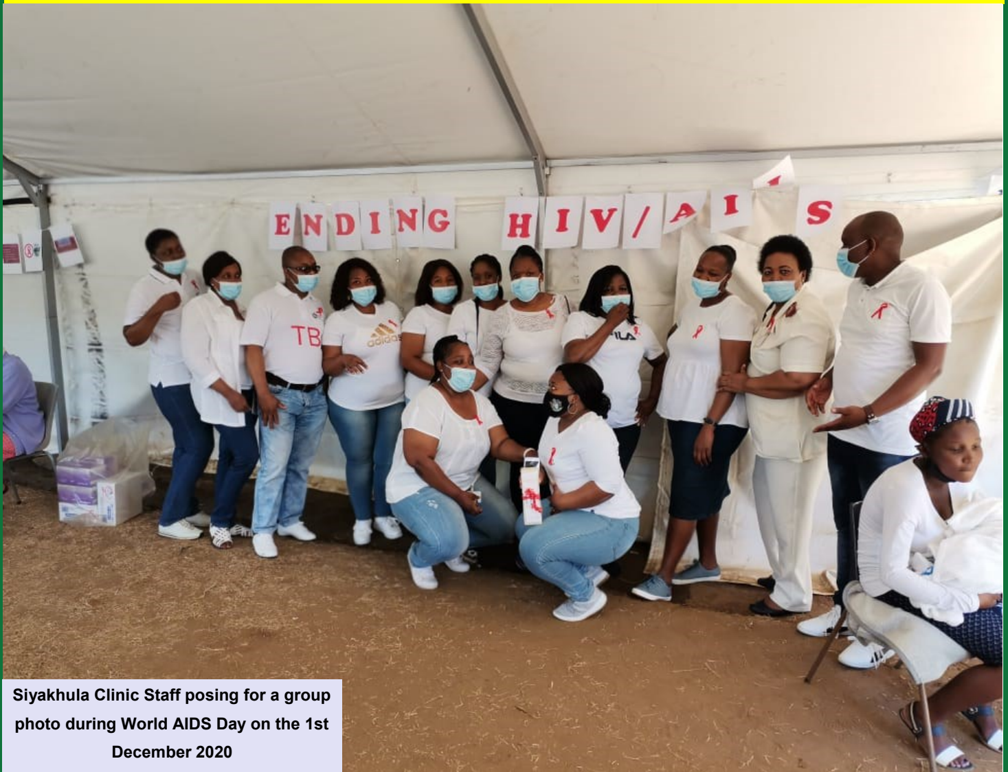
Siyakhula Clinic Staff posing for a group photo during World AIDS Day on the 1st December 2020