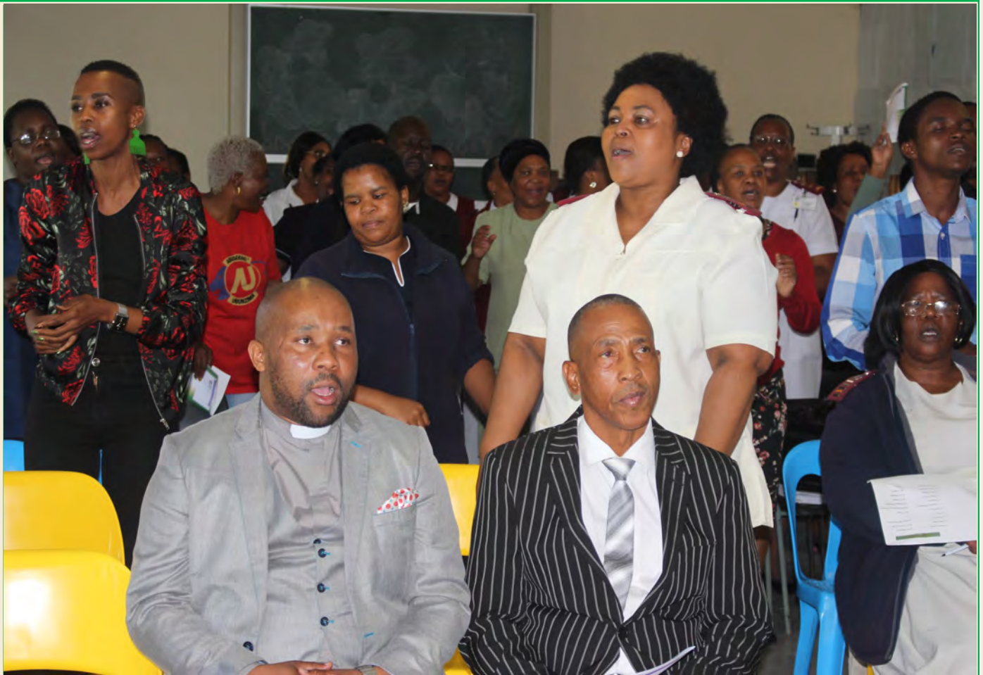
Aasenzi besibhedlela, abefundisi bamabandla ahlukeni kanye nabaphathi bamanesi bevuma ingoma ngosuku lomkhuleko