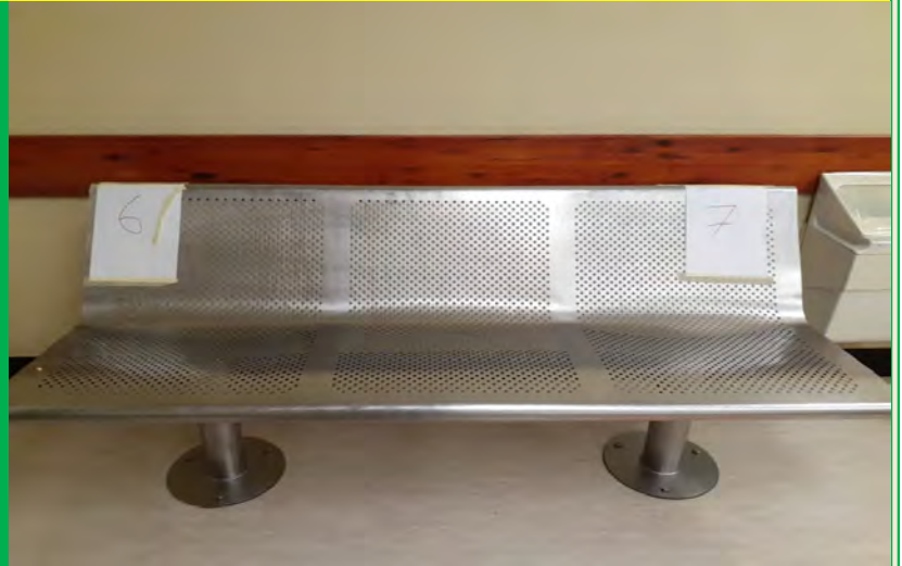
Social distancing adhered to in Hospital Pharmacy department

“There is no component that is not important in the hospital during this hard time, therefore we must avail ourselves” he said