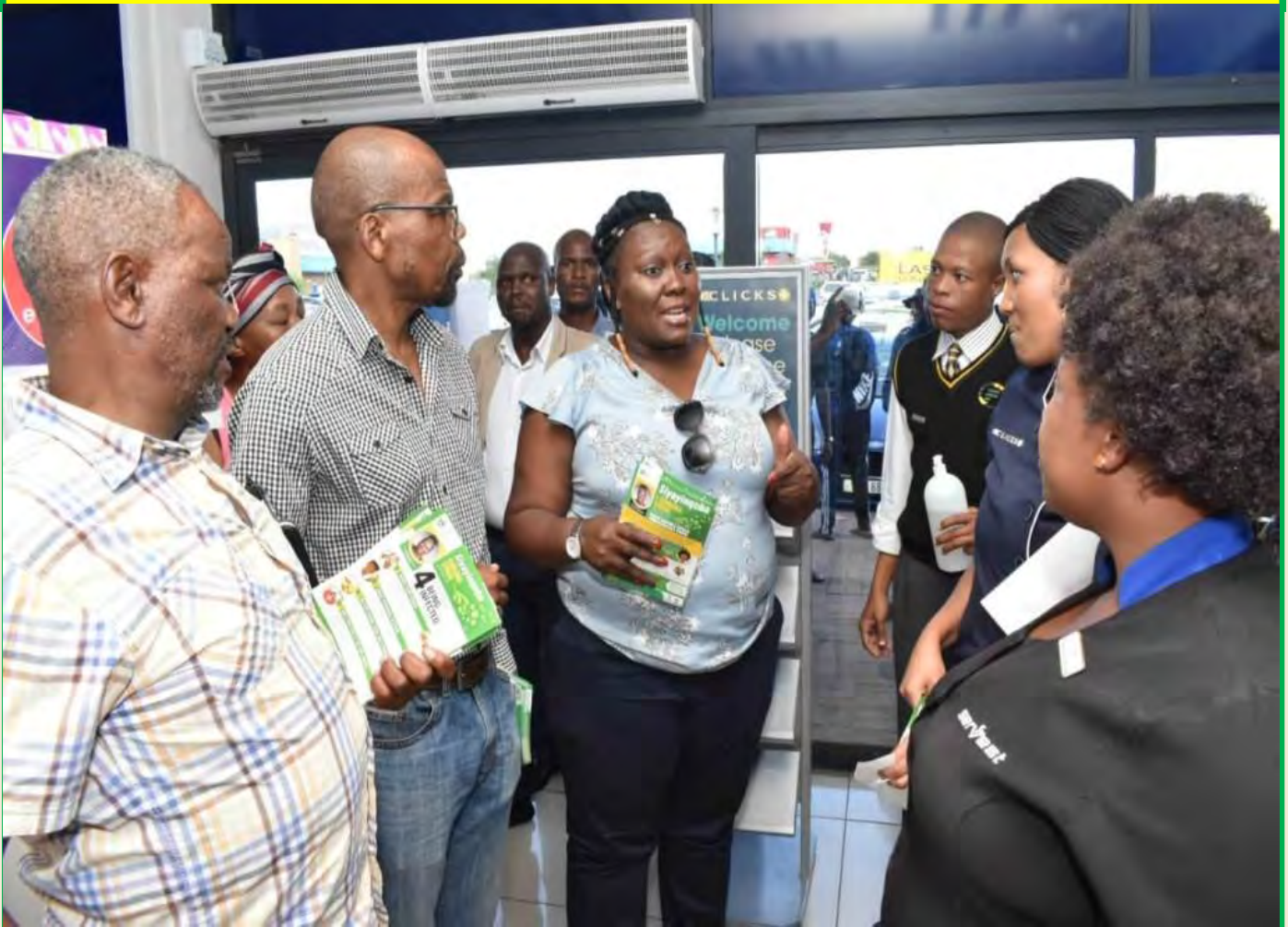
MEC for Health Nomagugu Simelane-Zulu educating employees from various stores about coronavirus at Theku Plaza in Newcastle. Seen in the picture is Bishop Mahlangu and the Mayor of Amajuba District Cllr Musa Ngubane accompanying the MEC