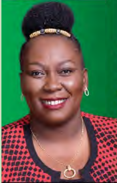
MS NOMAGUGU SIMELANE-ZULU MEC FOR HEALTH

KWAZULU-NATAL PROVINCE HEALTH REPUBLIC OF SOUTH AFRICA