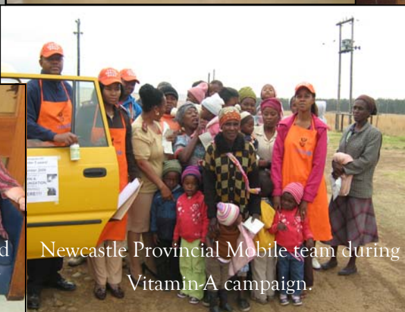
Newcastle Provincial Mobile team during Vitamin-A campaign.