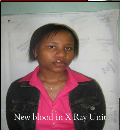
New blood in X Ray Unit