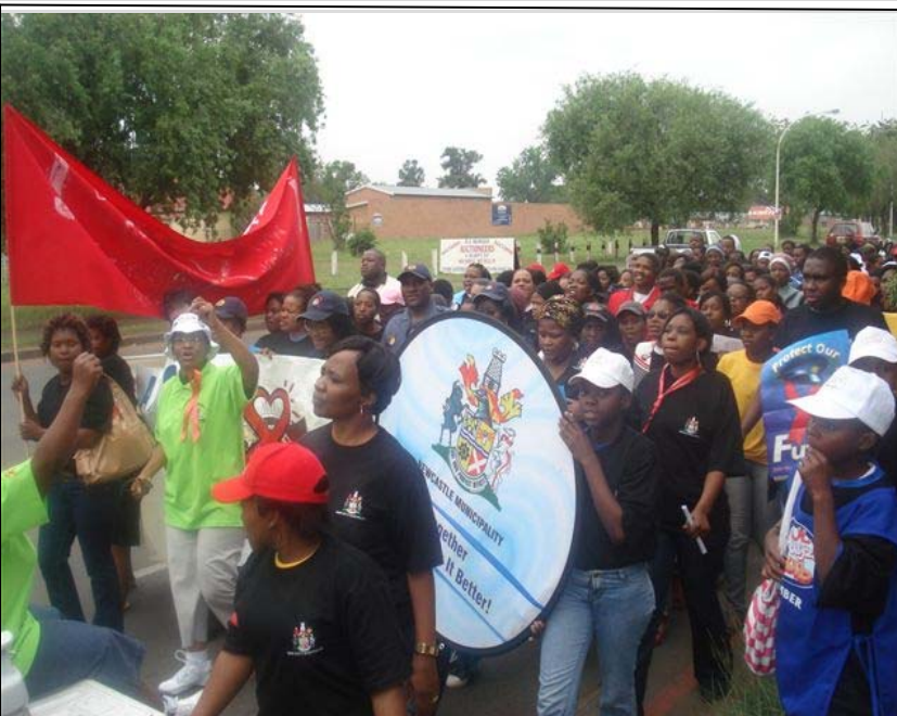
People came in numbers to support the HIV/AIDS march