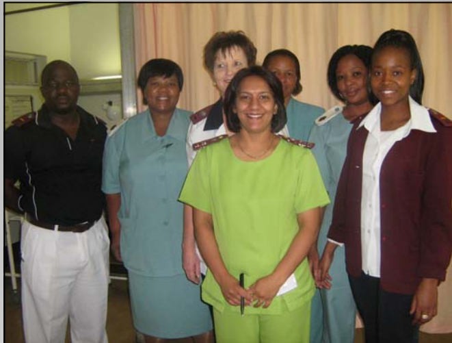
The ever smiling crew of Ward 1 with their Sister.

The management of Newcastle Provincial Hospital has decided to change the name of Stepdown Ward to Ward 1, this follows numerous queries coupled with various complaints and suggestions from community members regarding the abovementioned ward.