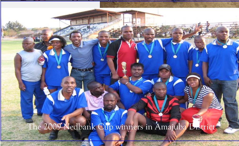
The 2009 Nedbank Cup winners in Amajuba District