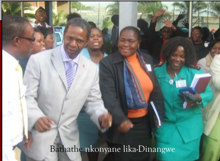
Bathathe nkonyane lika-Dinangwe