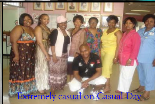
Extremely casual on Casual Day

Newcastle Provincial Hospital Management wishes to salute all the staff members who have gone an extra mile in making sure that all patients receive quality service under trying situations. May the new year be the year of love and happiness. Keep well on the road be safe with your families. Let us make 2009 a year in which we can look back and applaud ourselves for work well done. In 2010 let's adopt the FNB payoff line "HOW CAN WE HELP YOU" when dealing with our customers.