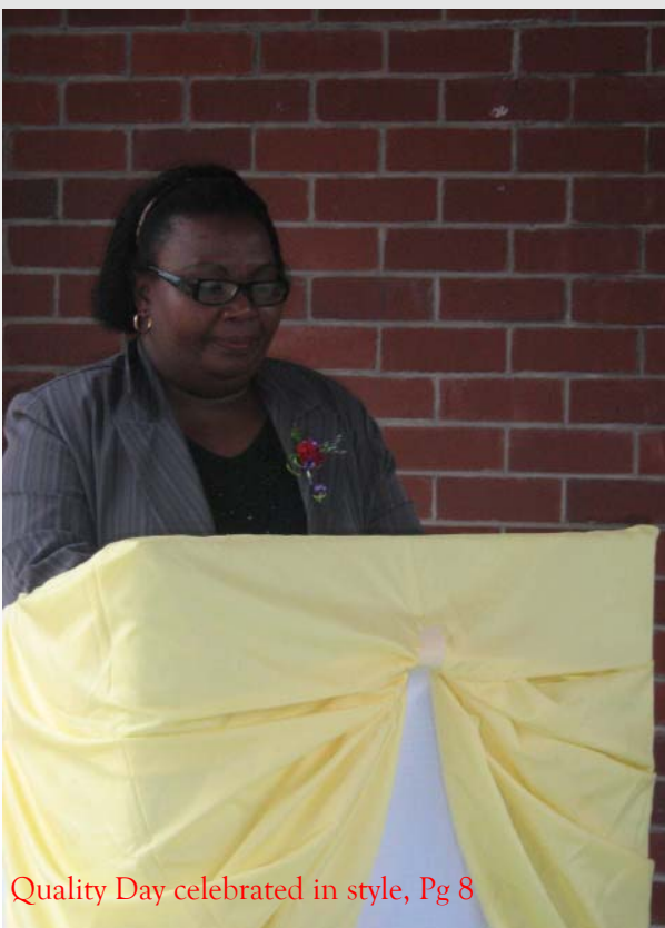
Quality Day celebrated in style, Pg 8

NB: Any persons who wishes to submit an article for publication must please contact the Editor on Ext. 2003 for guidelines.