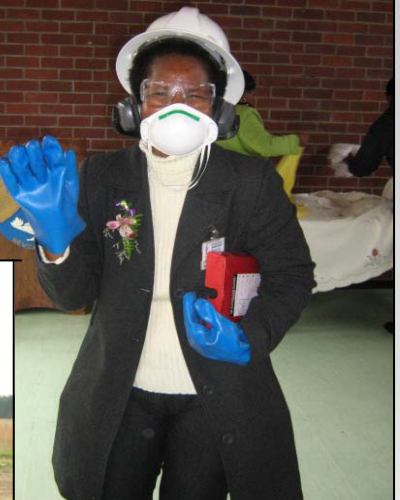
Best wishes for 2010

Newcastle Provincial Hospital Management wishes to salute all the staff members who have gone an extra mile in making sure that all patients receive quality service under trying situations. May the new year be the year of love and happiness. Keep well on the road be safe with your families. Let us make 2009 a year in which we can look back and applaud ourselves for work well done. In 2010 let's adopt the FNB payoff line "HOW CAN WE HELP YOU" when dealing with our customers.