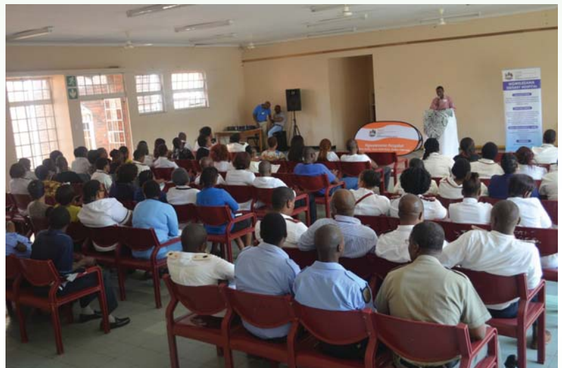
Above: Attendants during the event