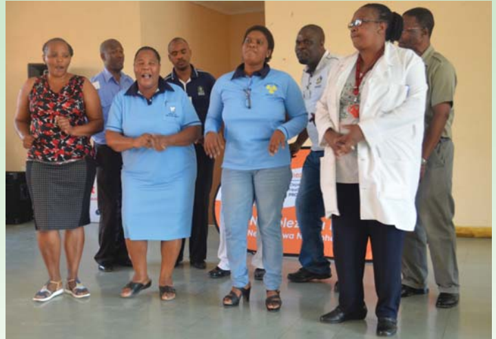
Above: Ngwelezana Hospital Choir giving us a very nice performance