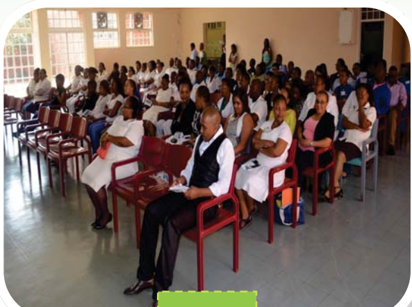
Above: Ngwelezana staff members who were attending the launch of men's and women's forum listening to the speakers attentively.