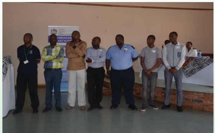
Above: the men's forum committee members include the chairperson, deputy chairperson, secretary and deputy secretary and additional members