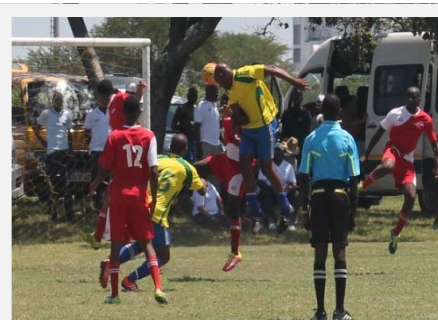
Department of Health Provincial Games 2015 read more on page 9.