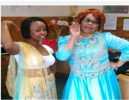
Niemeyer Hospital Heritage Day Cel- ebration read more on page 5.