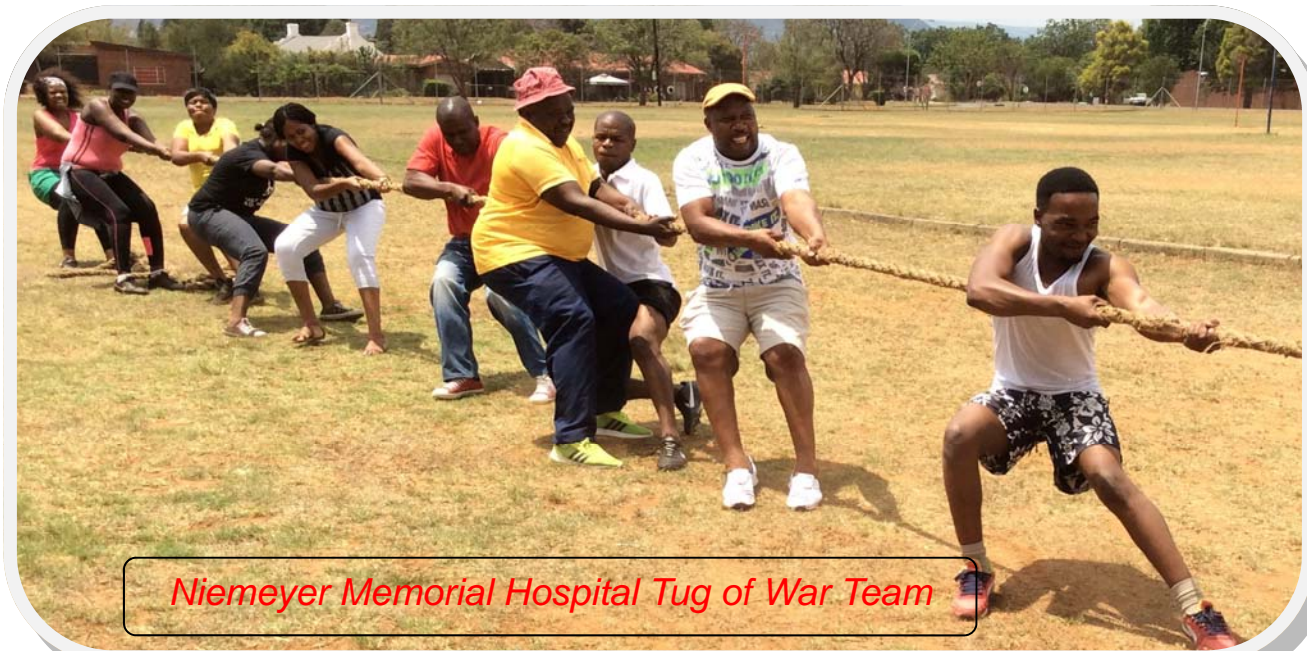
Niemeyer Memorial Hospital Tug of War Team