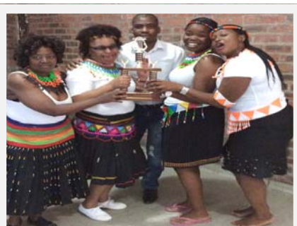
Amajuba District Choral Music competition read more on page 7