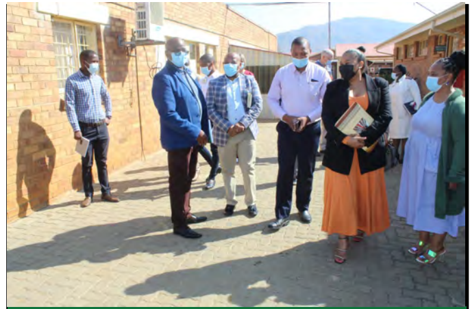
Legislature functionality visit.