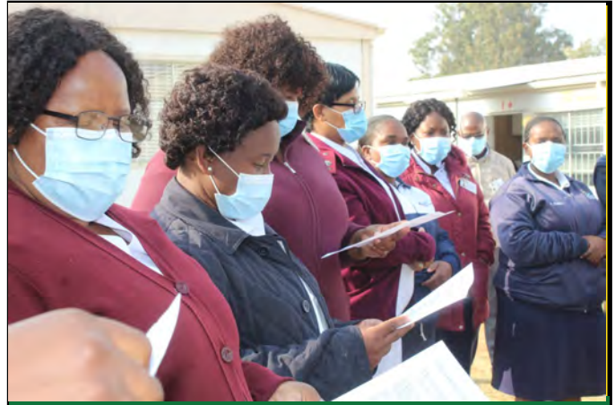
Nurses reciting the nurses pledge outside PHC.