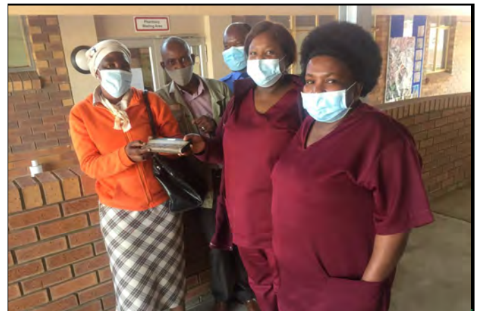
COVID 19 OM's handing over Patients wallet after she had lost it.