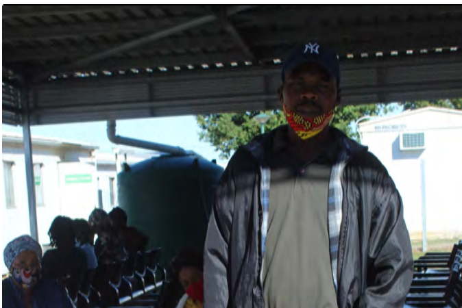
A Patient at PHC poses for a picture.