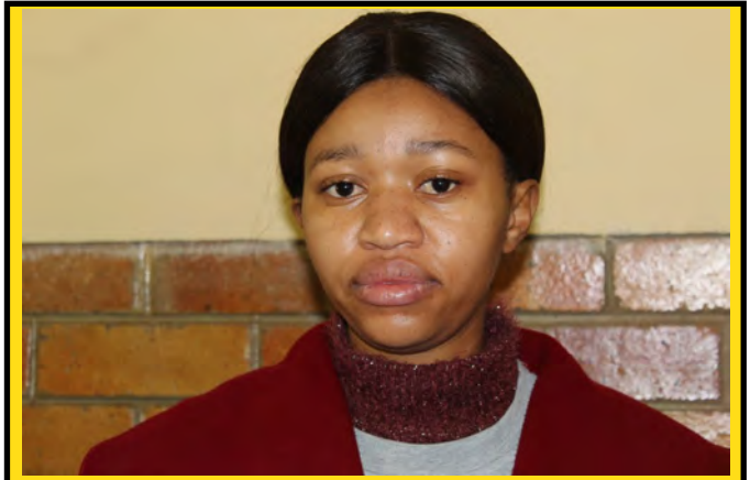
NTLOYA N Data Capturer: 01 July 2021