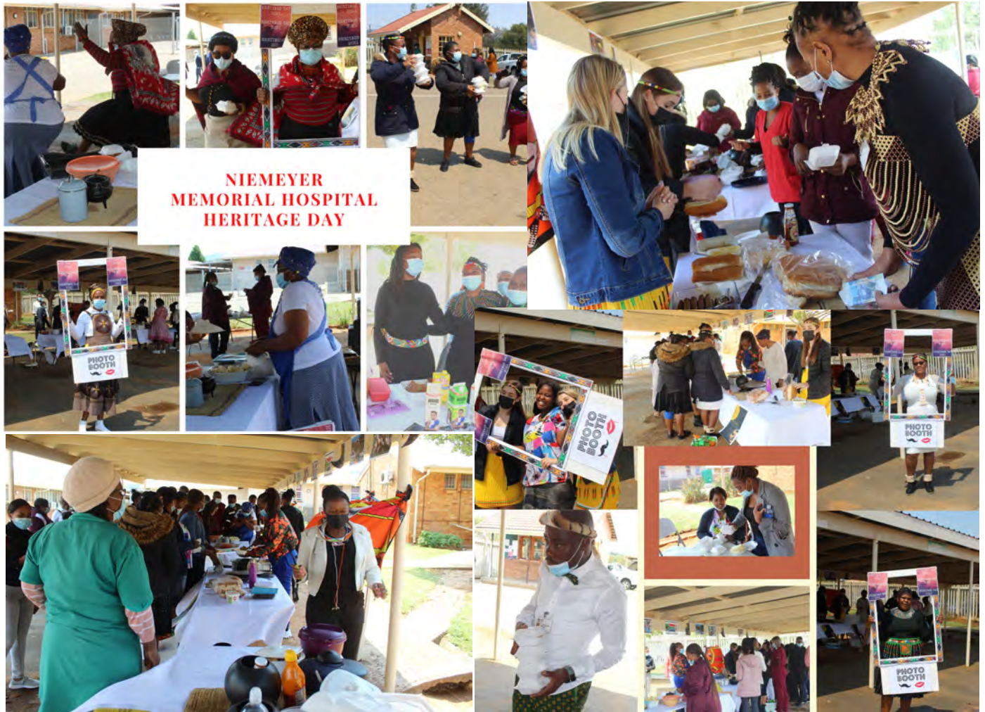
NIEMEYER MEMORIAL HOSPITAL HERITAGE DAY