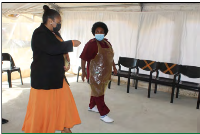
The honourable Legislature MPL (A Napena) and Sr Mkhize during the Legislature functionality visit.