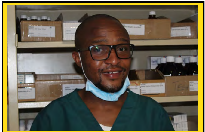
THUSI SI Pharmacist: 01 October 2021 " Working together we can do more"