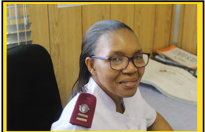
SHANGE SNB Professional Nurse: 01 September 2021 "God is good"