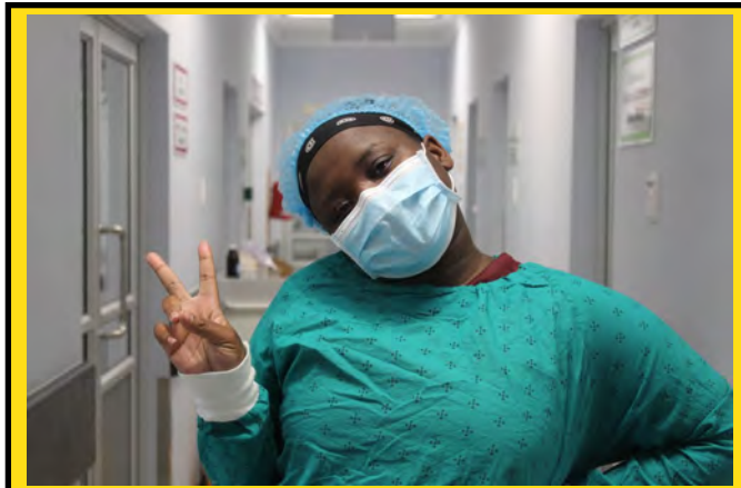
SULO Y Professional Nurse: 01 July 2021 "See the beauty in everything and dream in colors that don't exist"