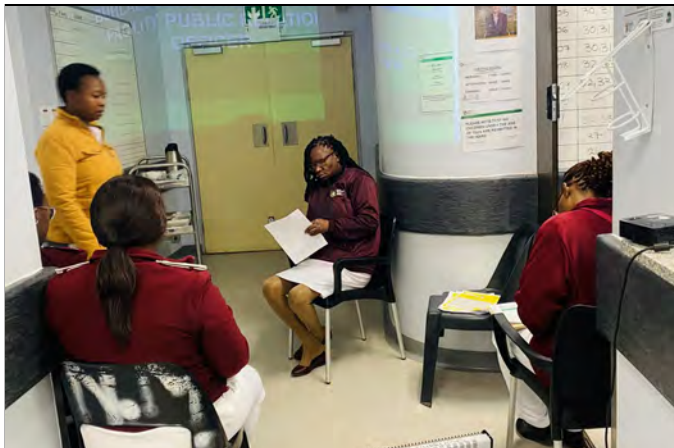
Staff settling down for a night training on Batho Pele and Patients Rights.