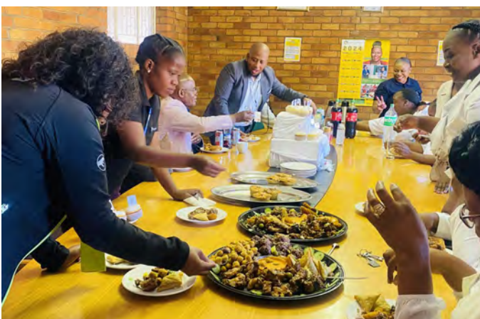
Management and Guests partaking in a lunch for after nurses day event