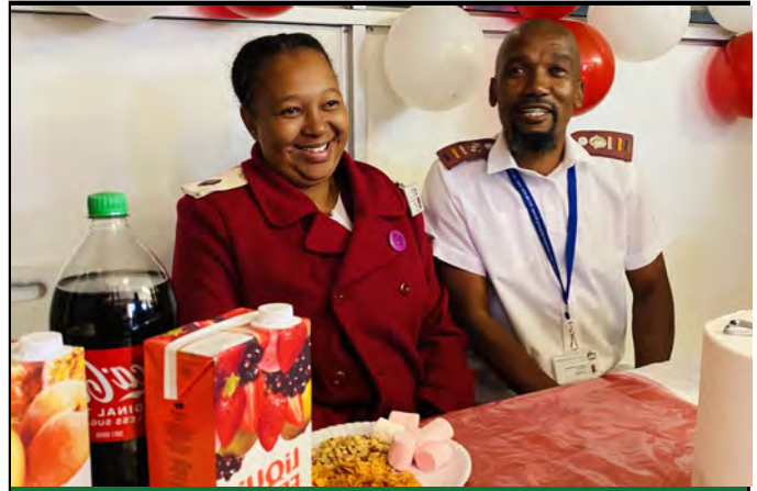
Mobile team members posing for a picture before Nurses Day breakfast.