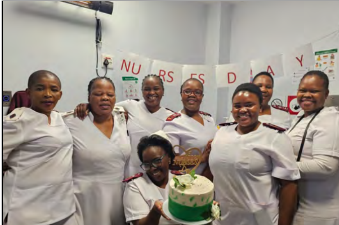
Maternity Ward Staff posing for a picture during their nurses day lunch.