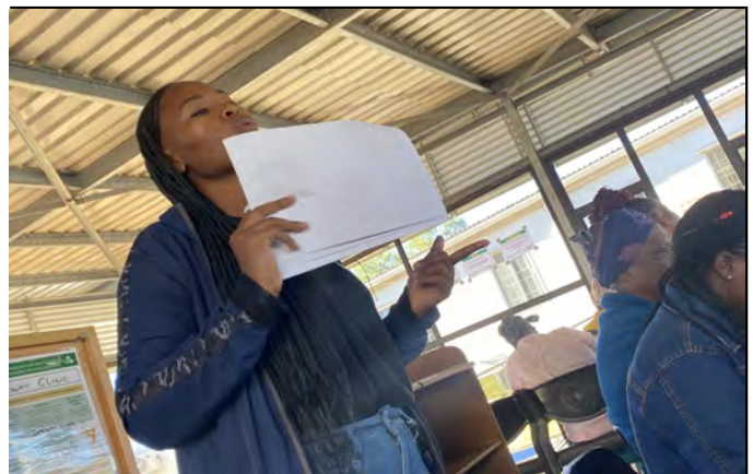
Occupational Therapist giving members of the public health education on Down Syndrome