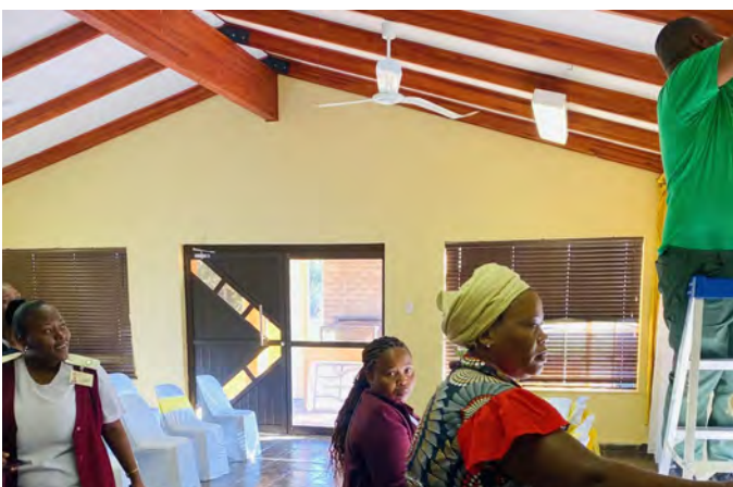
Staff members setting up for Nurses Day.