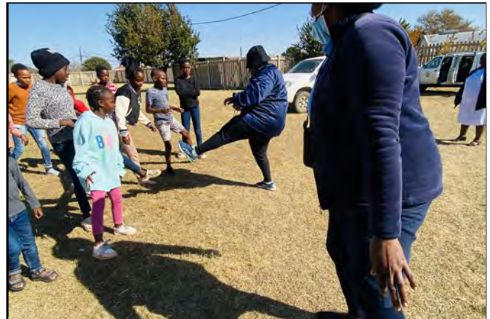
Outreach team doing aerobics with the public during a pregnancy awareness.