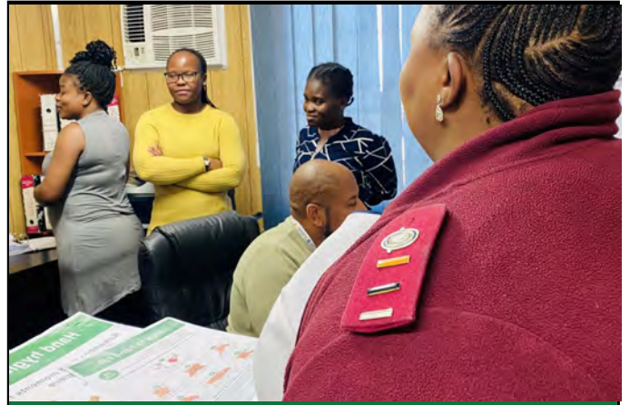
IPC Coordinator at HR during Hand Hygiene Day.