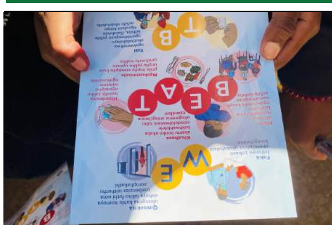
A Learner from Groenvlei Combined holding up a TB poster during a visit from us.