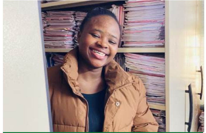
AT SANGWENI PUBLIC MANAGEMENT (INSERVICE) 01-04-2025 "When the time is right I the Lord your God will make it happen".