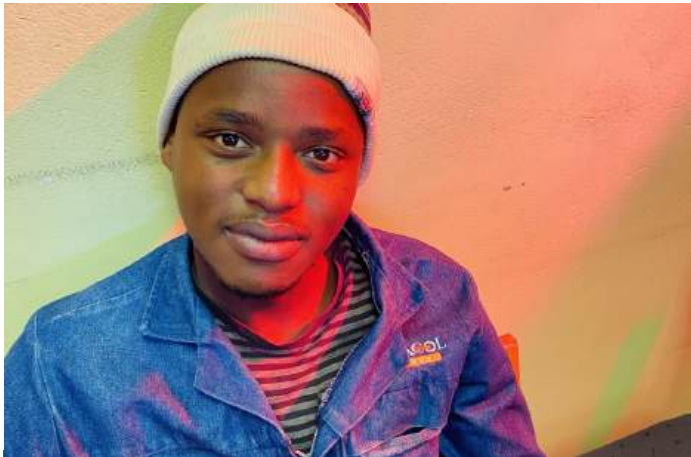
TC CELE— ELECTRICAL ENGINEERING APPRENTICE 01-06-2025