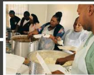
Staff members from various departments working collectively to serve lunch.