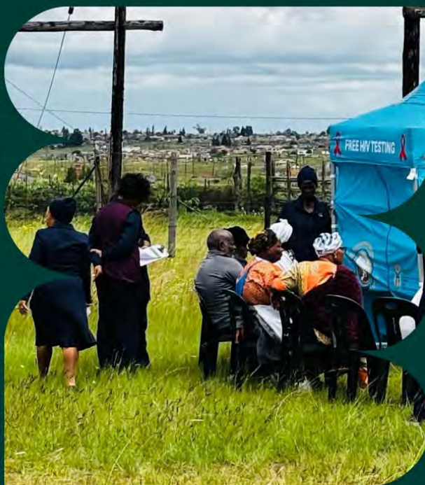
THE PUBLIC IN LINE FOR HIV TESTING.