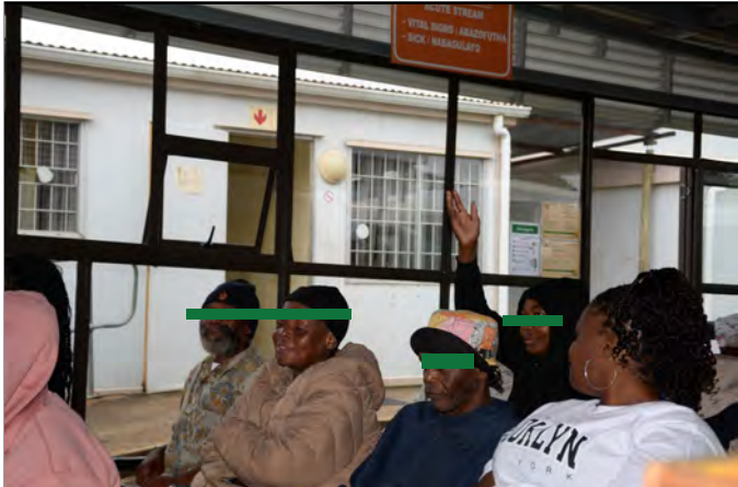
A patient raising her hand seeking clarification.