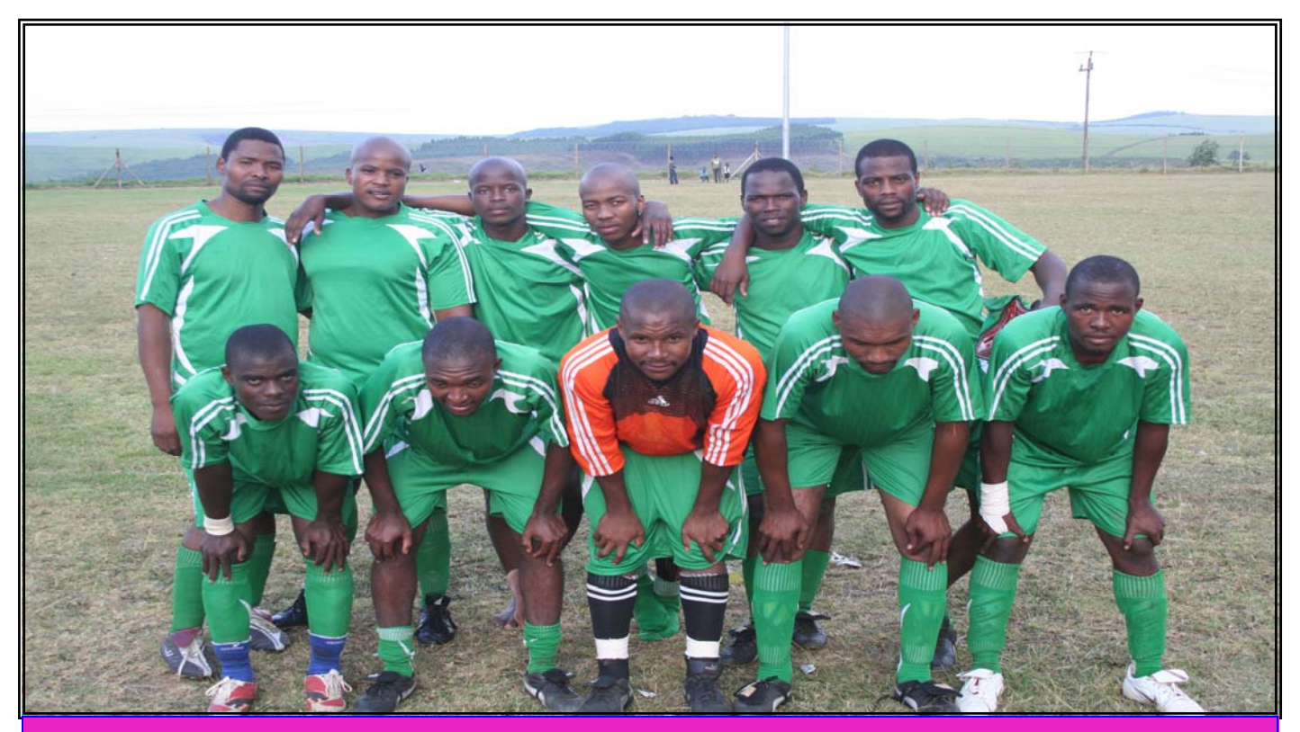
NKANDLA HOSPITAL SOCCER TEAM