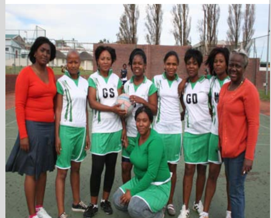
Below: The netball team, on the other hand is known to be the thorn in the flesh to most hospitals in the district.