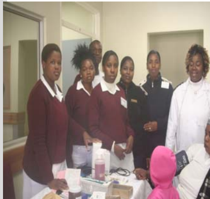
Some of Mpandleni clinic staff

Dadewethu kababa ezempilo zisondele kubantu, ngimfunge UCetshwayo eseNkandla!