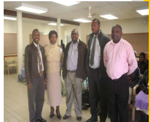
Members of hospital management made sure that they don't miss the first day of Mpandleni clinic.