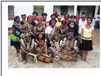
Hospital staff in traditional outfits. How beautiful!!