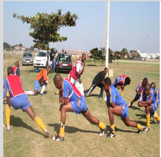
Above: The Nkandla hospital soccer team believes in hardwork and according to them nothing can prevent them from getting to the top.