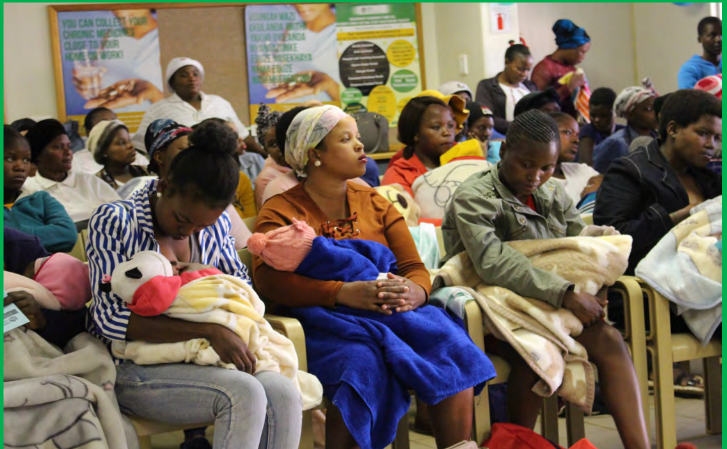
Below: mother's of children's around Nkandla came out in numbers to celebrates breastfeeding day at the clinic.