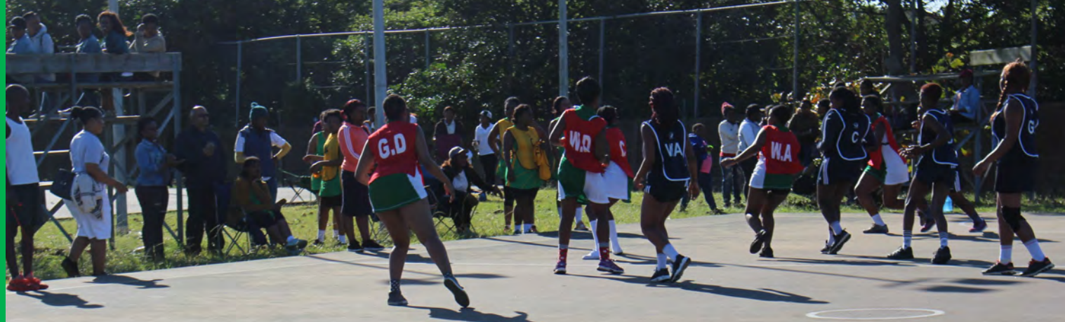
Above: Our ladies netball team in action. They lost their final game with a small margin. Siyanibongela mantombazane nisebenzile. Below: Player coach is providing advises and tips to fellow team mates on how they should approach the game.