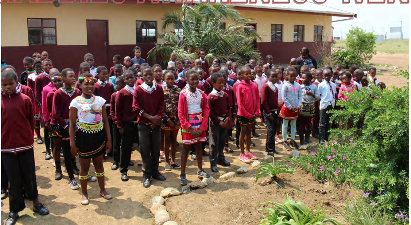
ABOVE: Pupils at Nqambushana Primary School listened to the guests from Nkandla hospital and KCD alerting them about rabies. Teachers were also part of this aware-