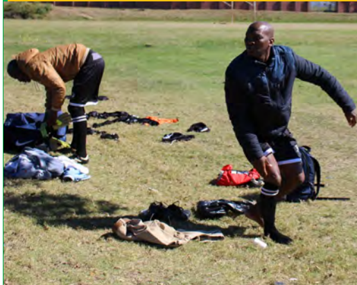
Below: some of the action that took place during the day.