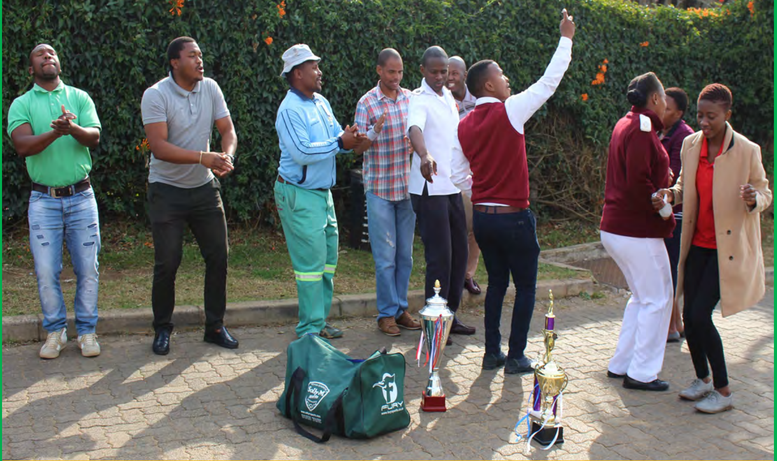
Above: Boys and girls, from Nkandla hospital celebrating within the hospital premises, displaying their trophies and medals.