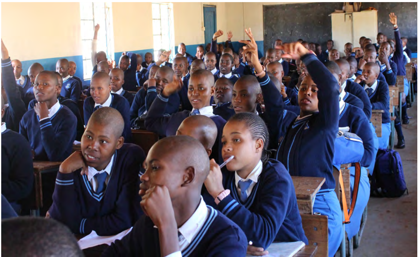
ABOVE: Pupils at Lushaba High School were listening to the pharmacists addressing them about everything concerning