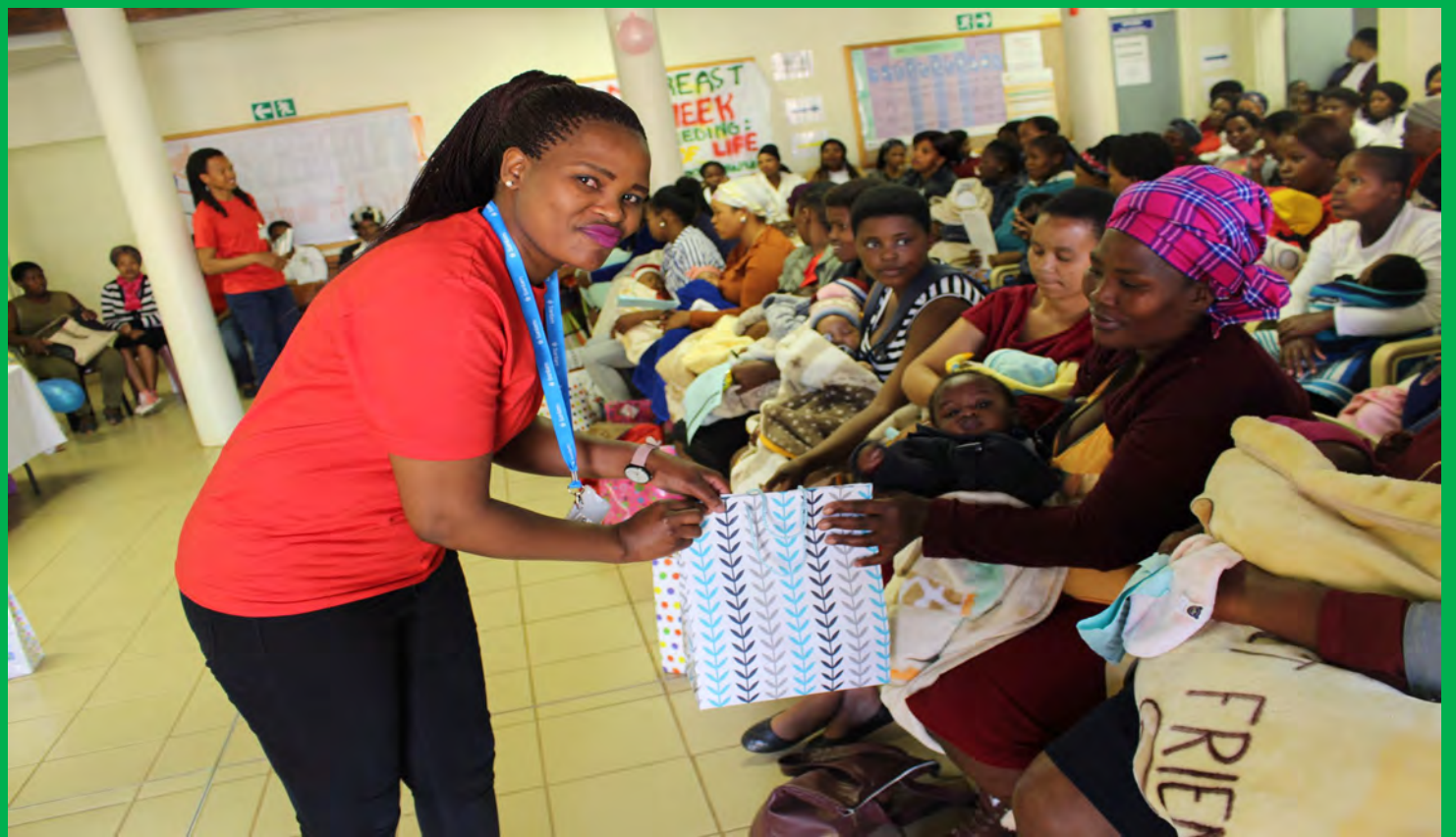
Above: Nutritional advisor at Mpandleni clinic was captured giving gifts to the mothers of children's who were at the event on that day.