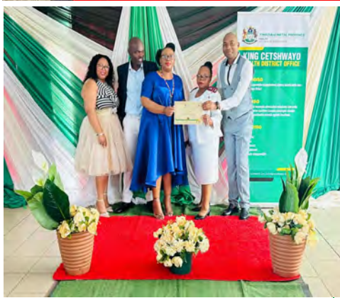
2023 QUALITY DAY EVENT