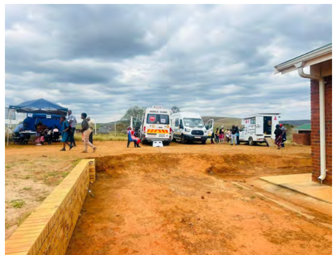
THE MOBILE TEAM WAS DEDICATED TO RENDER THE SERVICE TOWARDS THIS COMMUNITY.