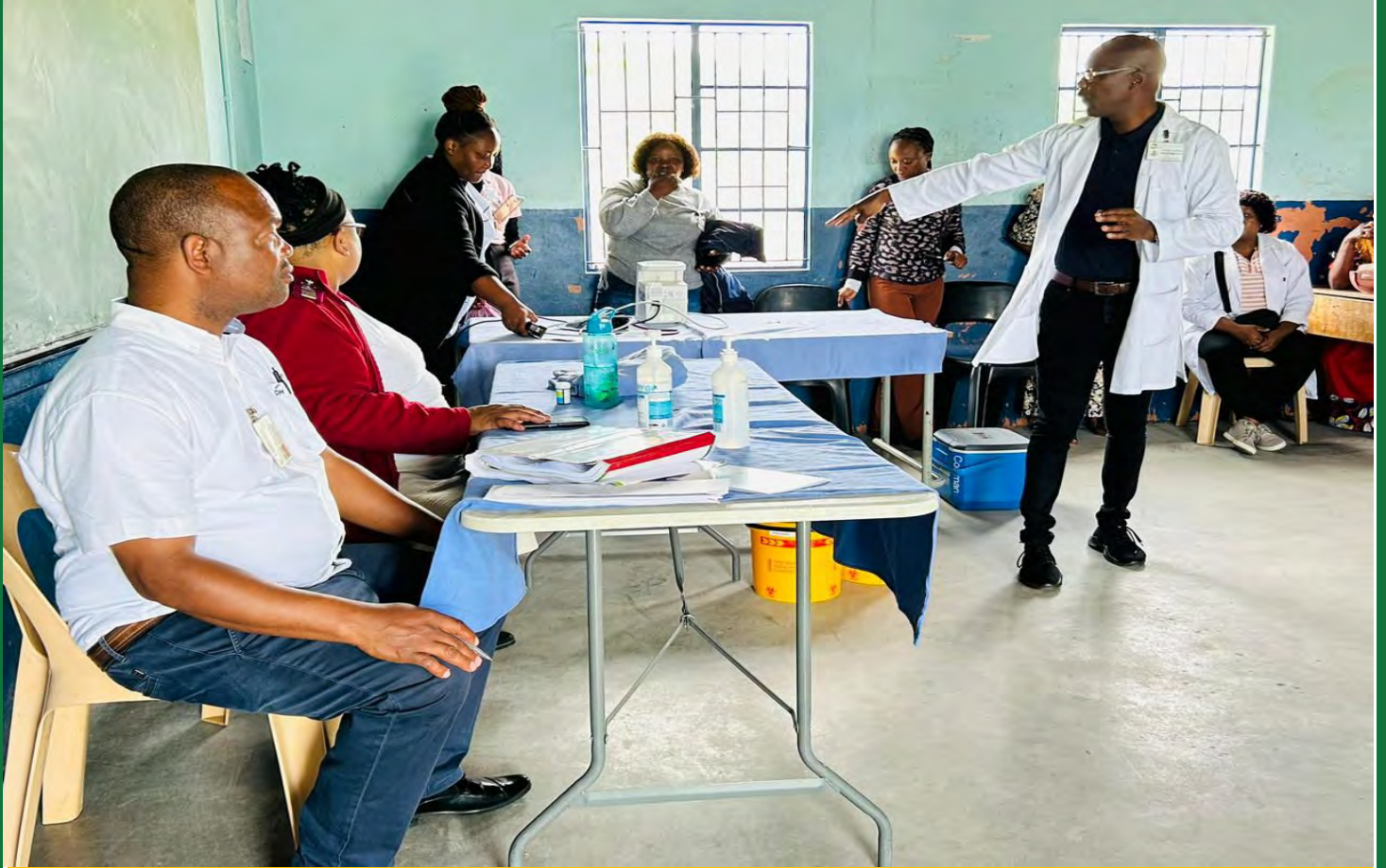
NKANDLA DISTRICT HOSPITAL TOOK THEIR SERVICES TO KUKHOBA COMMUNITY.