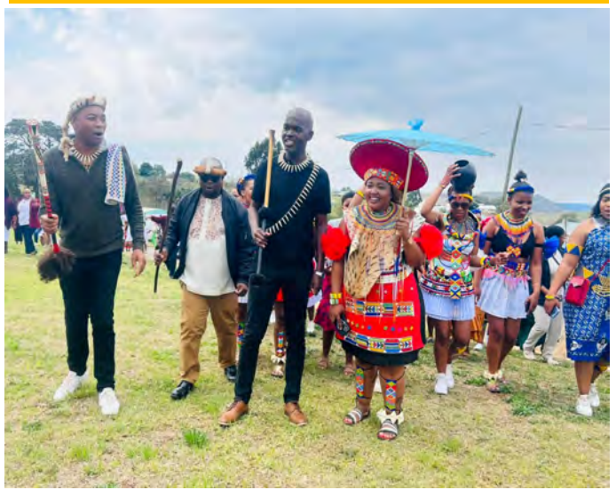
THE FATHER OF THE BRIDE AND THE BRIDE.