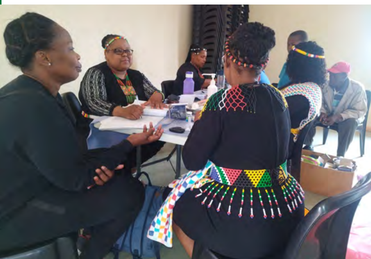
MOBILE TEAM (OUTREACH) WERE THERE TO RENDER THEIR SERVICES