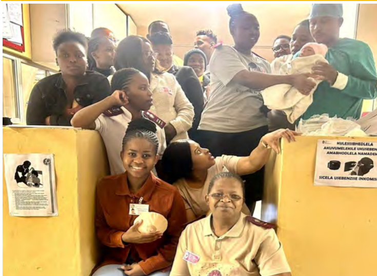
#LETS MAKE BREASTFEEDING A NORM