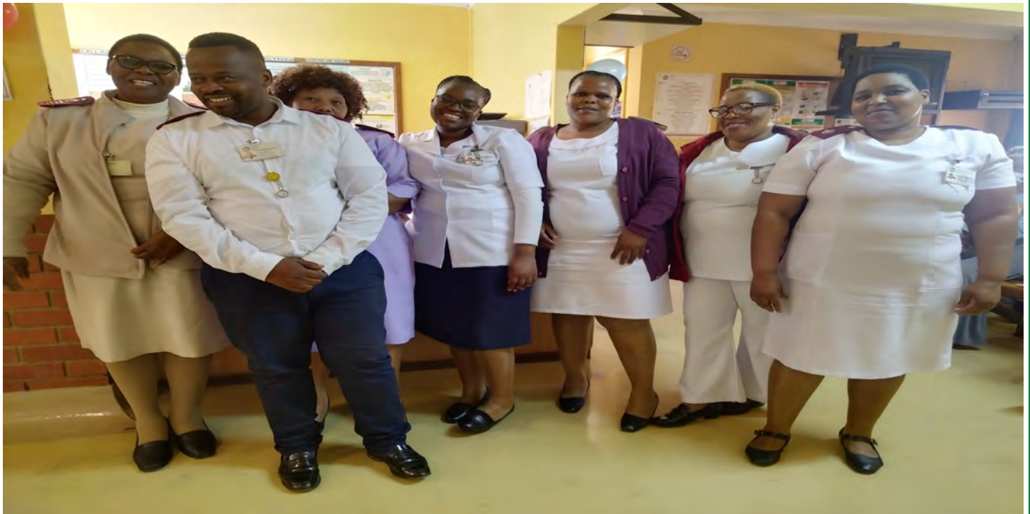
OUTPATIENT DEPARTMENT PARTICIPATING ON PROSTATE CANCER AWARENESS.