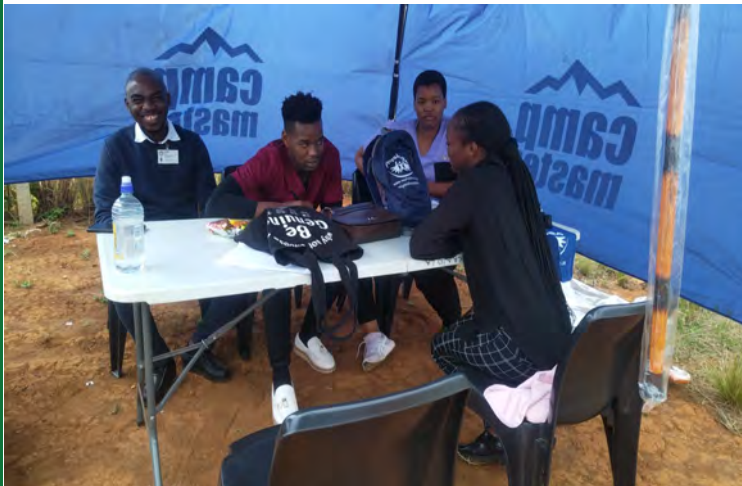
OUR OWN NKANDLA HOSPITAL DIETICIANS AND MENTAL HEALTH PERSONNEL RENDERING SERVICES TO THE COMMUNITY

On the 28th of September, Nkandla District Hospital took their services to Maphuthu community. Dieticians were present on this campaign to give health education about healthy food and the importance of having healthy lifestyle. The community was taught more about taking care of their bodies by exercising and how eating health food can reduce diseases. Social workers they were also present to educate community about taking care of their children and the consequence's they can face when they don't.