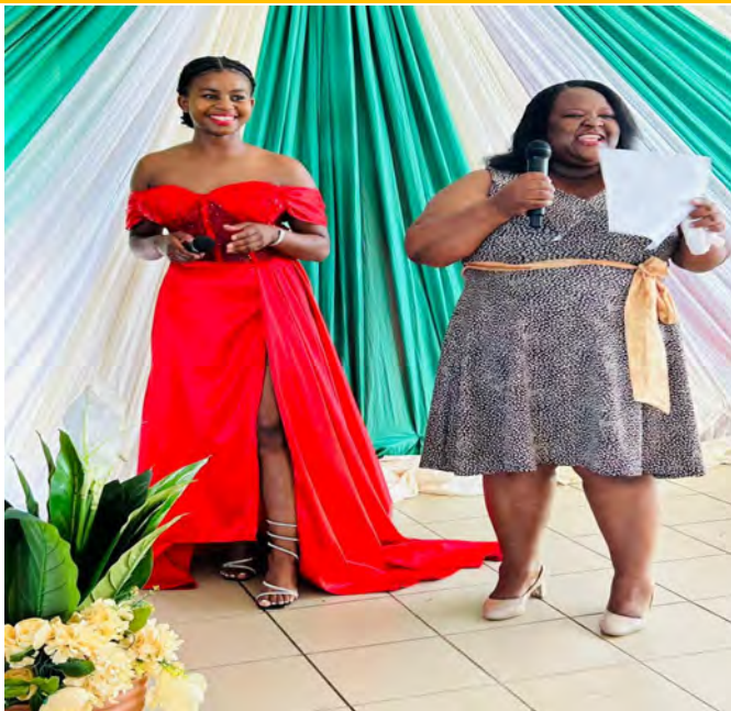
OUR MC'S OF THE DAY