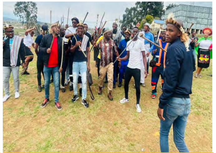
THE GROOM'S FAMILY.