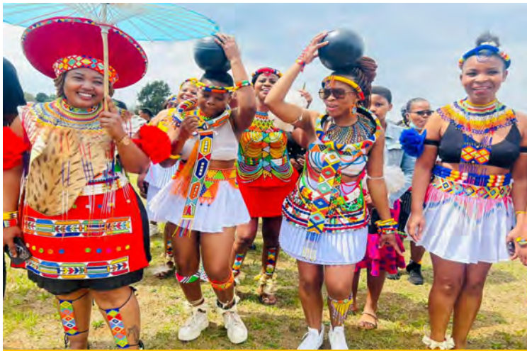
THE BRIDEMAIDS AND THE BRIDE.