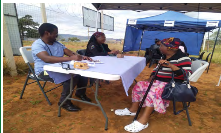
OUR DOCTORS RENDERING THEIR SERVICES TOWARDS THEIR COMMUNITY.

Our outreach team was working tirelessly to ensure that community is given efficient services accordingly. The hospital management was present during this huge campaign (isibhedlela kubantu) the feedback received from this campaign was awesome.