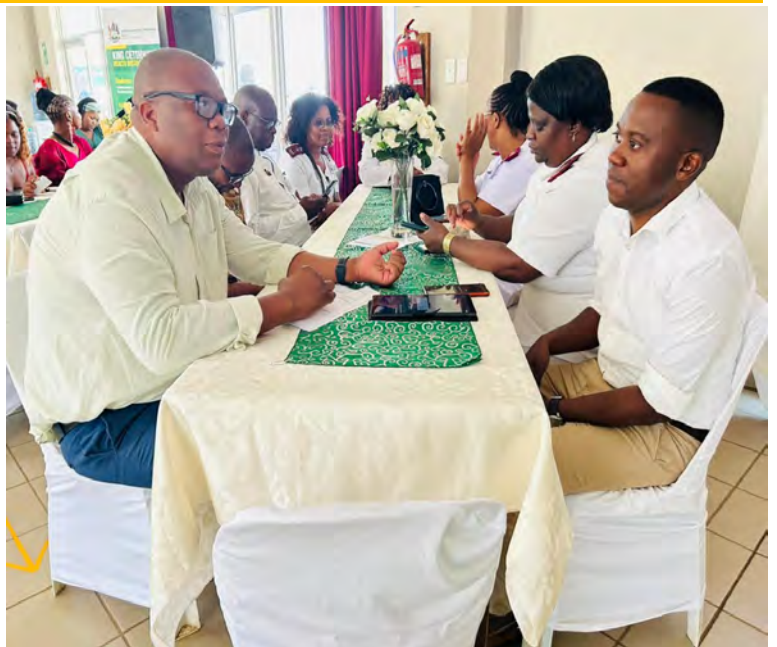
CLINICS OPERATIONAL MANAGERS