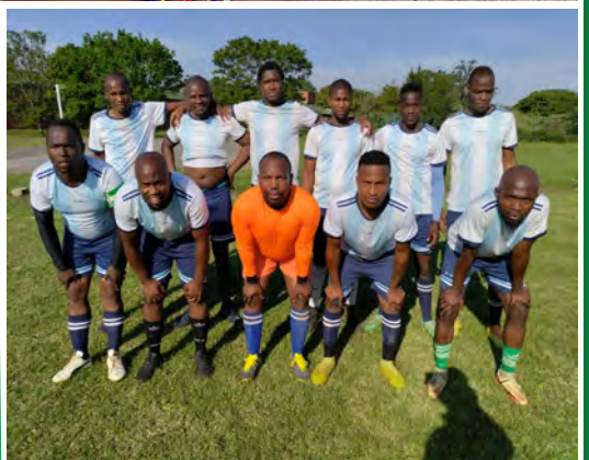
NKANDLA HOSPITAL FC (2023 DISTRICT TOURNAMENT)