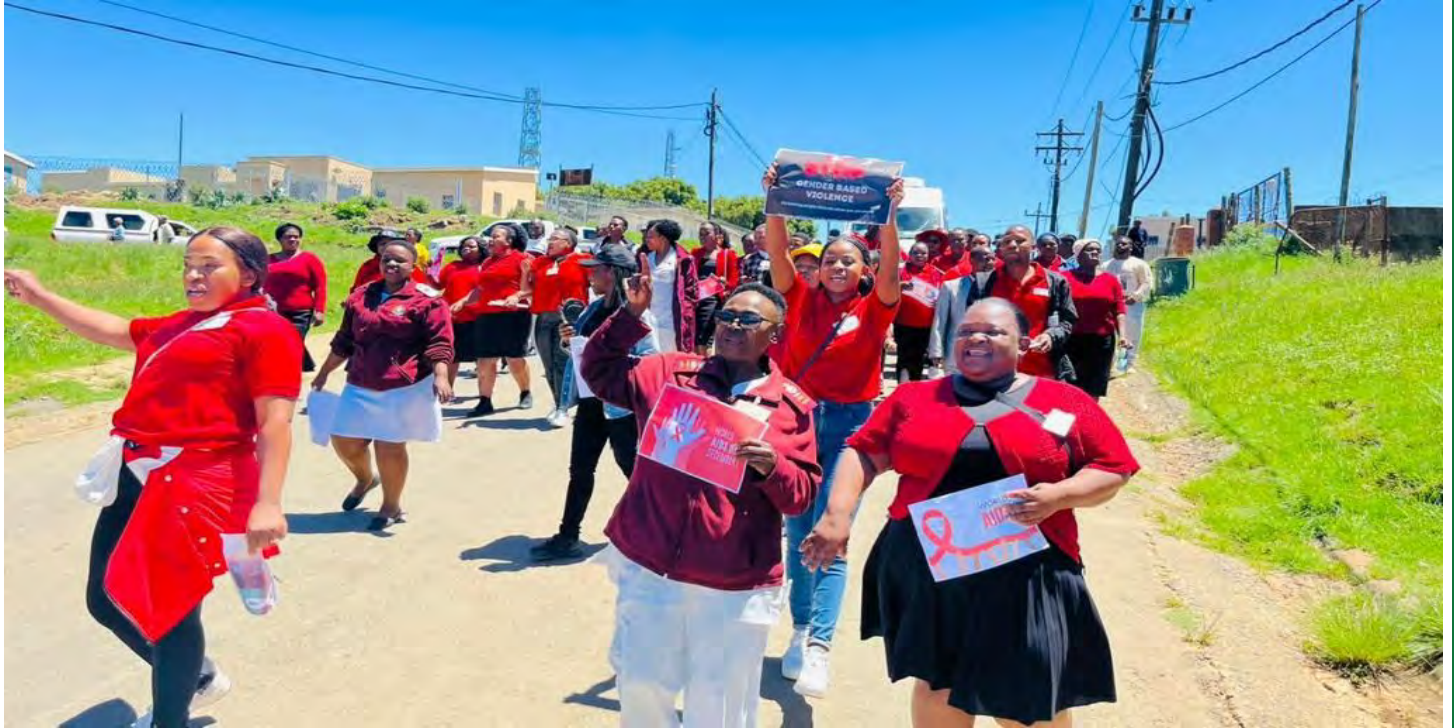
NKANDLA WORLD AIDS DAY CELEBRATION.

Every year the 1st of December commemorates World AIDS Day. People unite to show support for people living with HIV and to remember those who have died from AIDS related illnesses. Each World AIDS Day focuses on a specific theme which this year was LET THE COMMUNITY LEAD . Change depends not on the moment but on the movement. This message will not only ring out on one day, but it will be at the core of activities that will build up across the world.