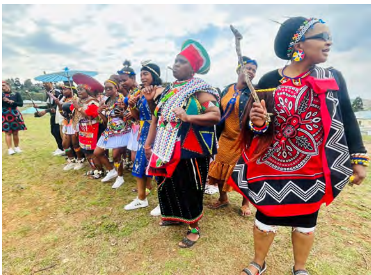
THE BRIDE'S FAMILY.