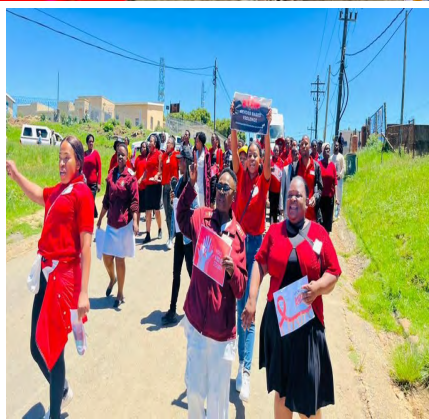
WORLD AIDS DAY COMMEMORATION