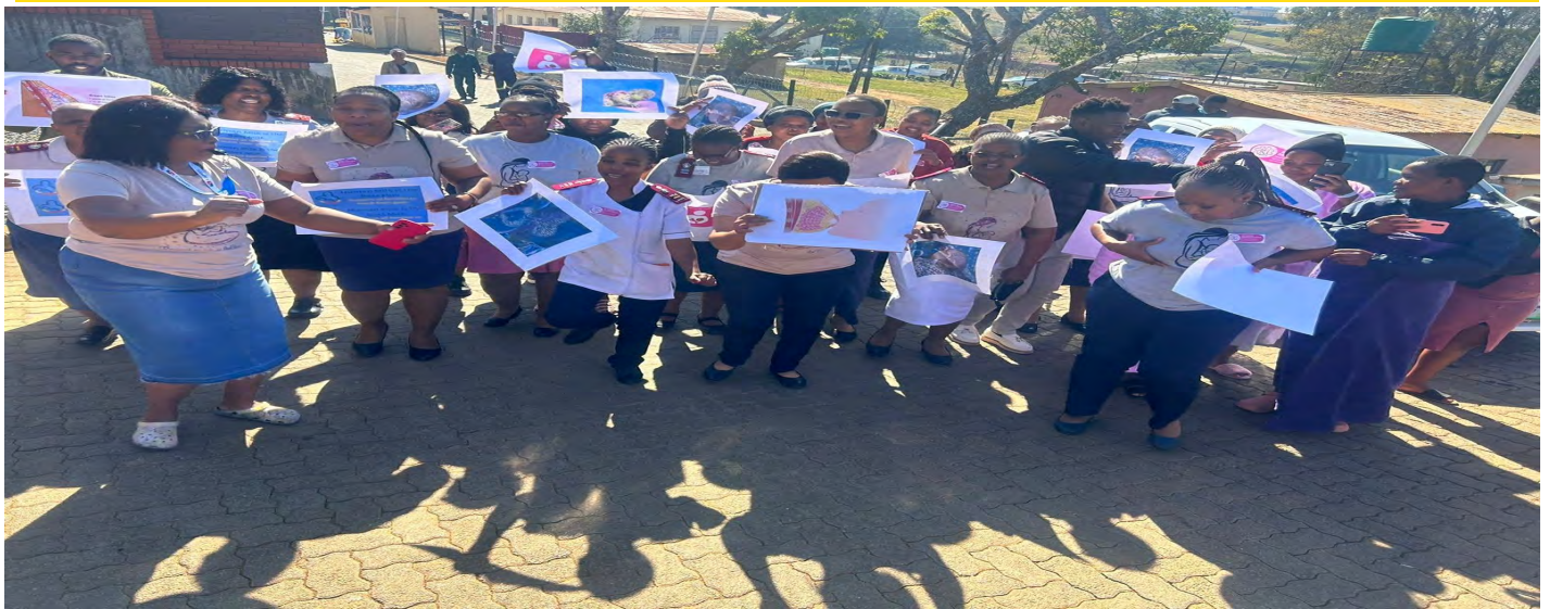
MARTENITY NURSES CAMPAIGNING FOR BREAST FEEDING AT NKANDLA HOSPITAL PREMISES