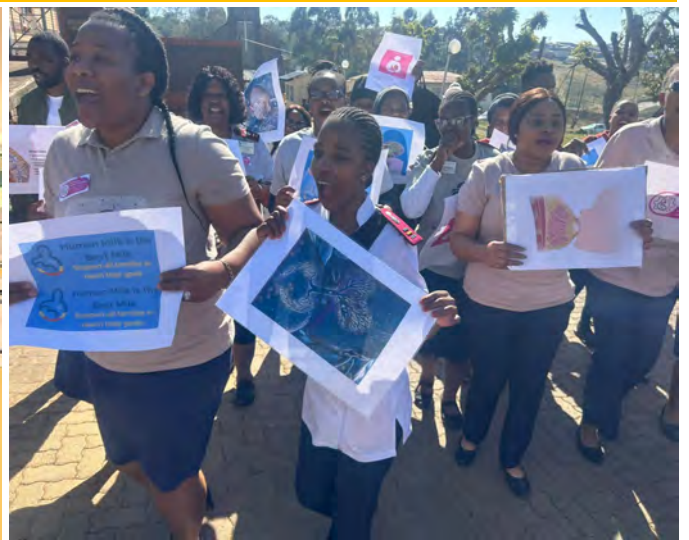
NUTRIENTS FROM BREAST FEEDING CAN MAKE THE BABY GROW MUCH HEALTHIER