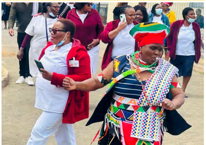
THE PROUD MOTHERS.