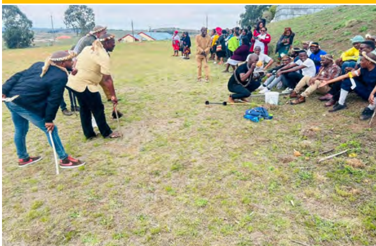
BRIDE'S FAMILY WENT TO GROOM'S FAMILY TO REPORT THEIR ARRIVAL AS BRIDE FAMILY.