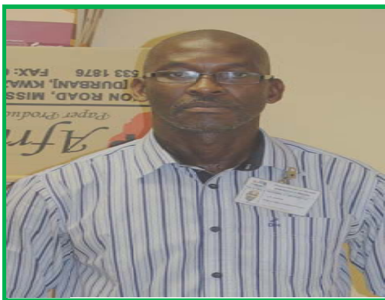
Jabulani. E. Zwane (PRO) PHOTOGRAPHER