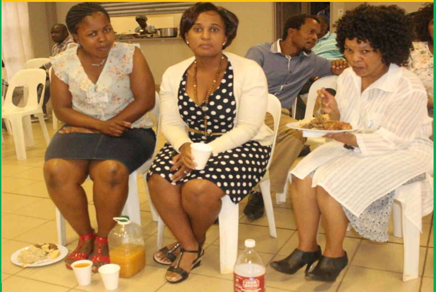
below: It was meal time. You can see on how delicious food was. Liyashaywa ibhodwe la