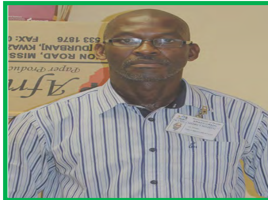
J.E Zwane PHOTOGRAPHER, DESIGNER, WRITER