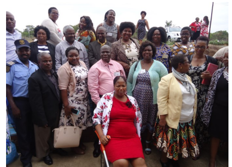
Zululand Jubilation on Ideal Clinics