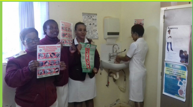
Below : Makhosini clinic staff members together with EPWP and Security guards on Hand Washing Day Campaign