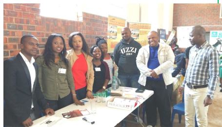
CAREER EXHIBITION 2016 READ MORE ON PAGE 3