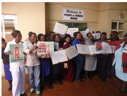
Hand Wash AWARENESS... READ MORE ON PAGE 1