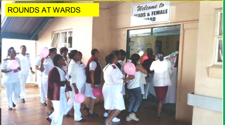
ROUNDS AT WARDS

THEME: "SUSTAINING BREASTFEEDING TOGETHER, BREASTFEEDING AND ITS RELATION TO THE SUSTAINABLE DEVELOPMENT GOALS"