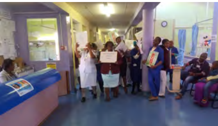
Awareness at Paeds Ward