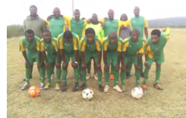
READ MORE ON PAGE 9