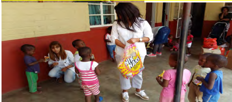
The Pharmacy team arriving at Koningsdaal Childrens Home, Babanango