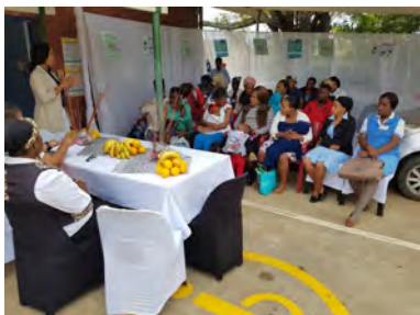
Umdumezulu Clinic Awareness READ MORE ON PAGE 3

THEME: “Love Them, Protect Them, They are the future” Child Protection Week and Awareness Celebrated at Umdumezulu Clinic.