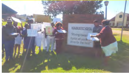
Team members of IPC next to Hospitals 'Motos'