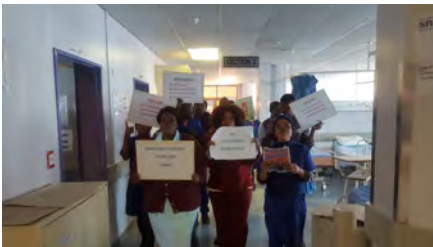
Awareness at Male Wards