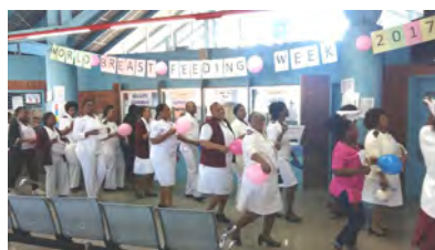
READ MORE ON PAGE 05