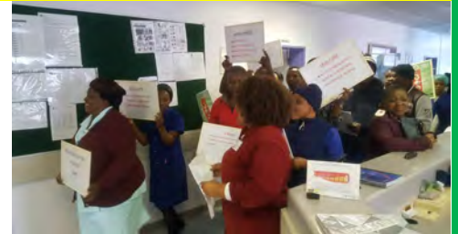
Awareness TEAM Rounds