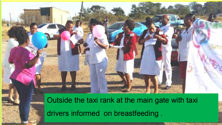
Outside the taxi rank at the main gate with taxi drivers informed on breastfeeding .