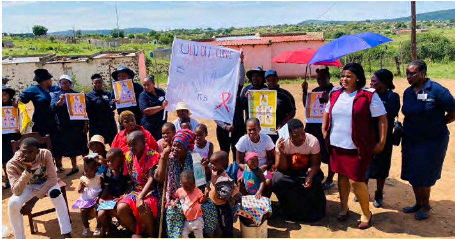
Umtholampilo Ulundi A Clinic , with CHW on TB

THE EVENT WAS HELD AT EZIHLABENI ART AND CULTURE RECRETIONAL CENTRE WITH ZULULAND DISTRIC HEALTH MUNICIPALITY ENVIRONMENTAL HEALTH .