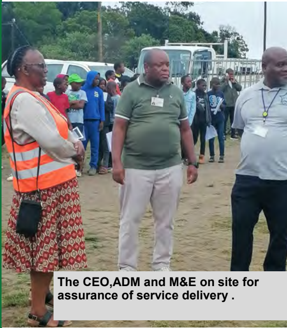
The CEO,ADM and M&E on site for assurance of service delivery .

Health Services were rendered at Nhlungwana Area Ward 24, the number of attendees were unexpected, were raised up to more than 300+ compared the last visit.