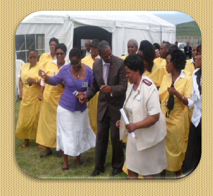
The MEC, CEO & NM sing with the Choir Osindisweni Choir