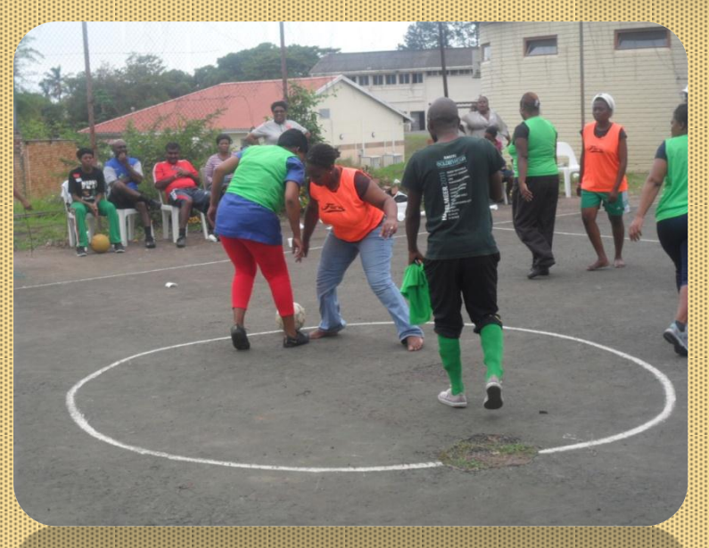
Ladies doing the men's job