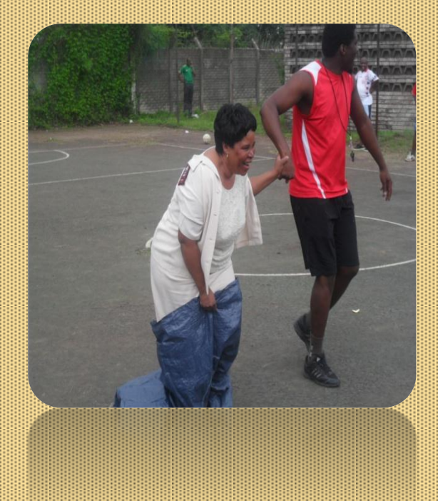
Indonda emva iqanda phambili