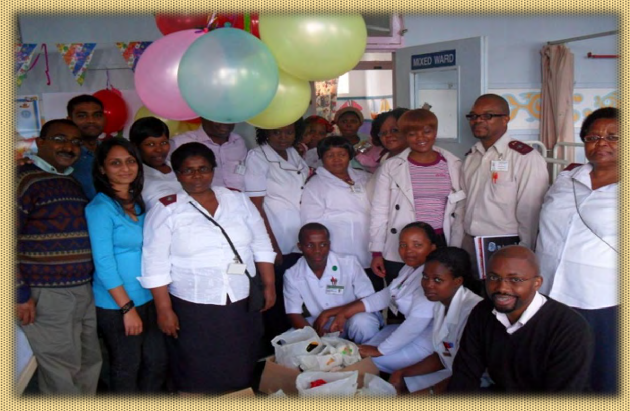
EThekwini Municipality joined Osindisweni Hospital family in celebrating of Mandela Day