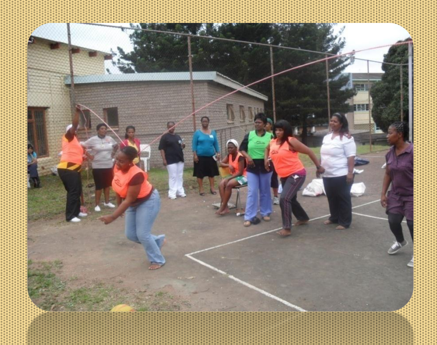
They call it ingqabeshu