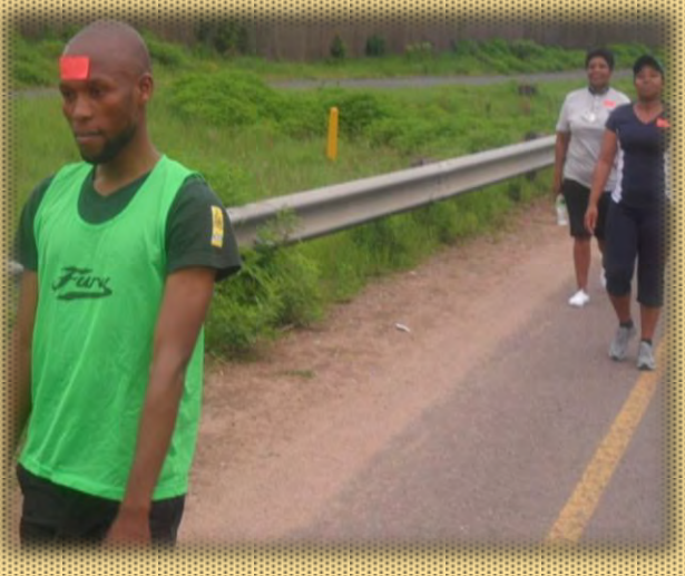
Osistaz umuntu nesphuzo sakhe