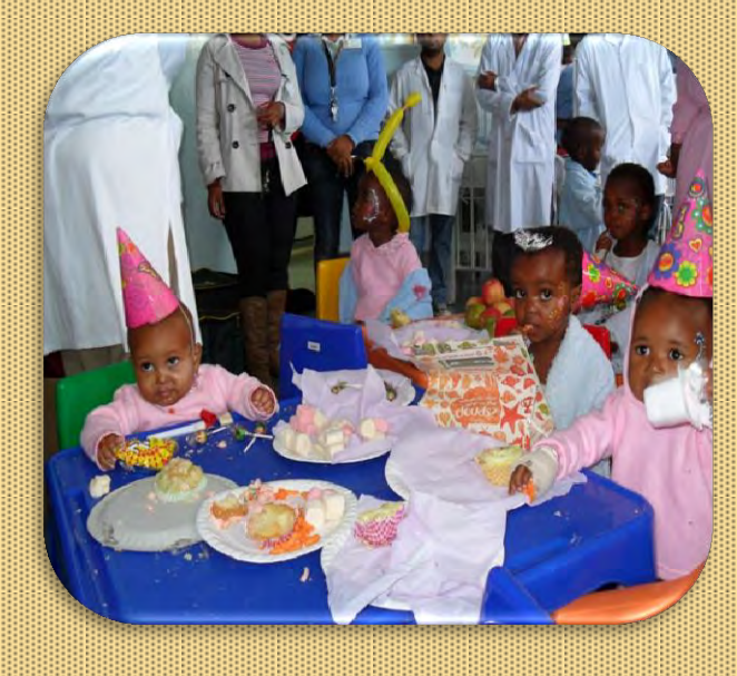
Bebezitika ngoncamnce nezipho odado