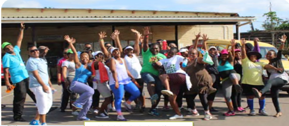
Kujuluka indoda sifuna amafiga no6 pack