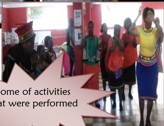
Some of activities that were performed