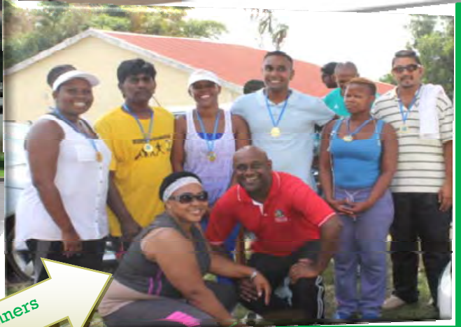
Fun walk winners