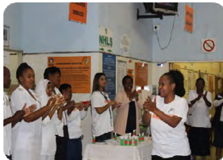
HANDWASH CAMPAIGN READ MORE ON PAGE 5