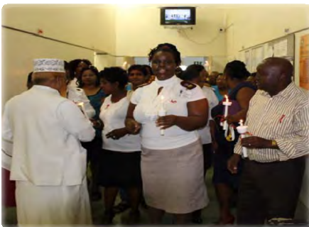
WORLD AIDS DAY READ MORE ON PAGE 4