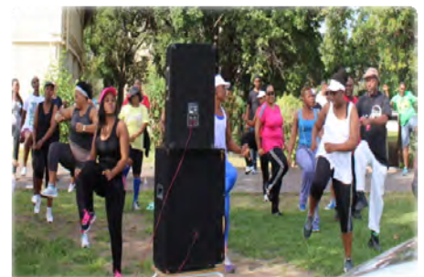
AEROBICS AND FUN WALK READ MORE ON PAGE 8