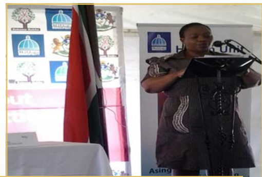
LEFT SIDE: Lighting of the candle RIGHT SIDE: MEC Nomusa Dube- Ncube gave a presentation emphasizing the fact that people should be tested for HIV and to embark on living a healthy life