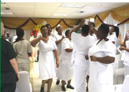
Nurses Day celebration Read more on page 4