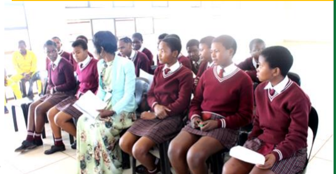
Phumlani High School Learners