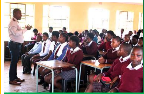
Community dialogue on teenage pregnancy . Read more on page 8