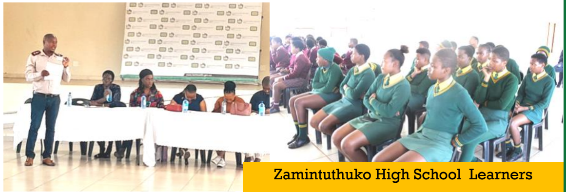
Zamintuthuko High School Learners

The District office team (MCHW & School Health), Community leaders and other stakeholders (Jozini Local Municipality, SORD and Thuthuzela Care Centre) was also part of the programme.