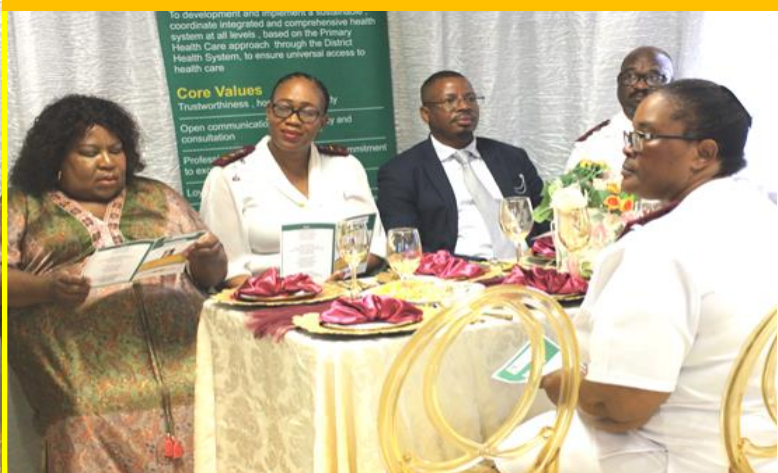
Reserved table for Management