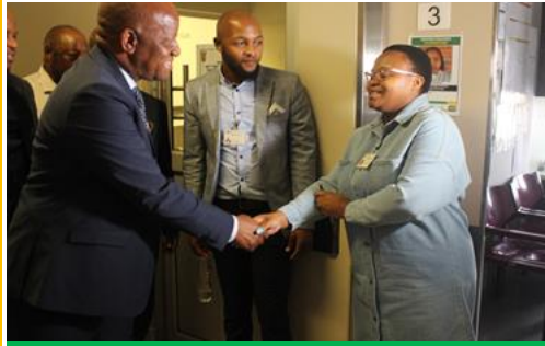
Cabinet Visit through OSS Read more on page 4