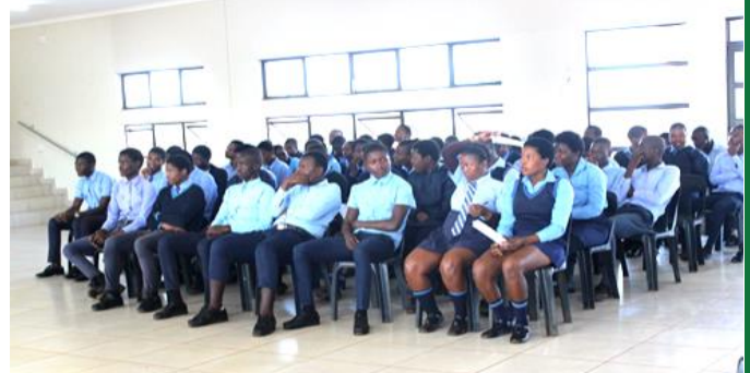
Malobeni High School Learners