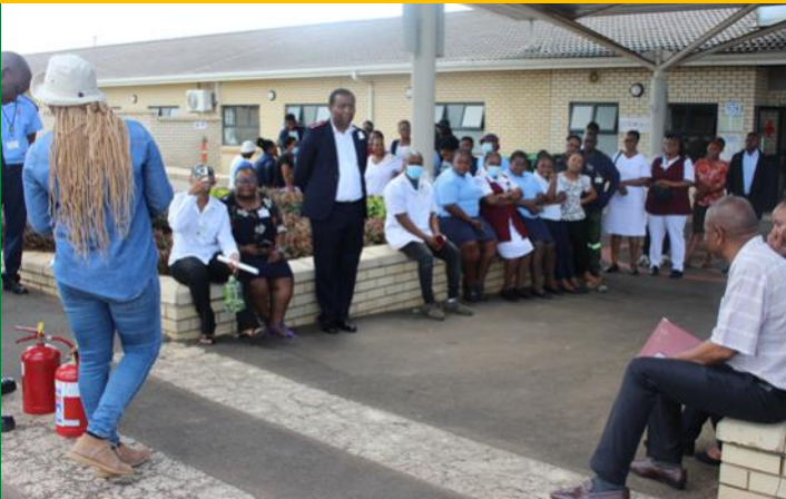
Staff from all sections gathered and listened attentively

The Office Health and Safety together with Safety Reps from all sections conducted the Fire Disaster Drill training in October 2024 to the staff and patients at Othobothini CHC. The team from Jozini Municipality under Disaster Department rolled out this training.