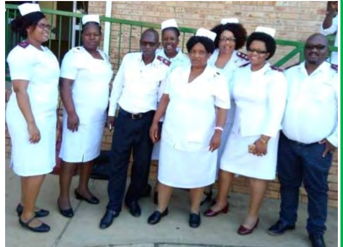
Jozini CHC Staff took a group photo after their gathering

Ethical communication in the workplace is another area that staff needs to be clearly trained on.