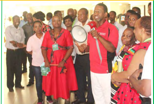
PAP Drive Plus awareness READ MORE ON PAGE 3