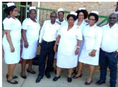
Ethics & Professionalism team READ MORE ON PAGE 4