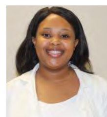
N.A Nene Pharmacist Comm.serv