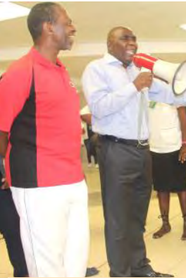
uMeya wesifunda saseMkhanyakude edlulisa ukubonga kumalunga omphakathi abehambele lomkhankaso.