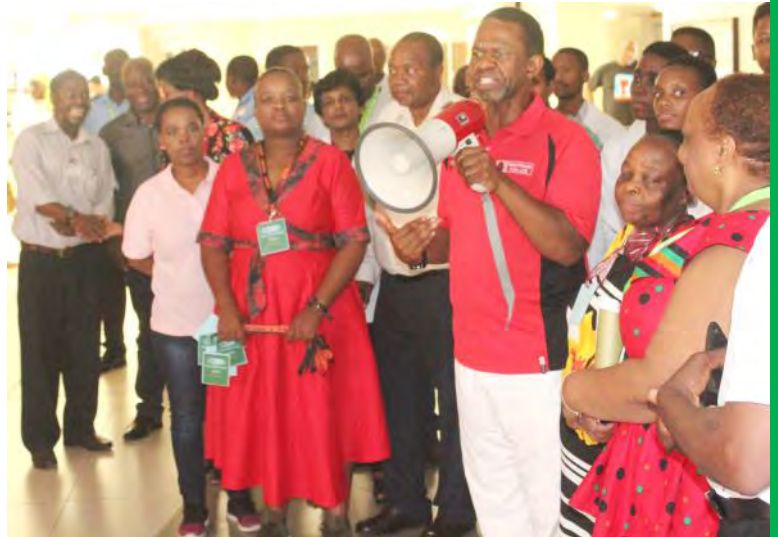
Ungqongqoshe wezempilo eqguquzela amalunga omphakathi ngokubaluleka kokuhlolela umdlavuza nobungozi bawo.

uMeya wesifunda saseMkhanyakude uMhlonishwa ubaba uMkhombo udlulise ukubonga okukhulu kuNqogqoshe wezempilo ngalesisenzo sokunakekela izimpilo zabantu.