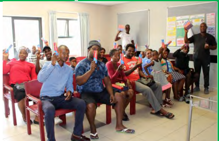
Abebevakashele emtholampilo ngalolusuku bejabulela isipho

Lapha isithombe esithathwe emazinyweni (Dental services) kanye noDokotela emva kweziluleko zokunakekela amazinyo ngendlela efanele. Baphinde bahalalisela uncibijane omuhle ithimba elisebenzela kulesisigceme.