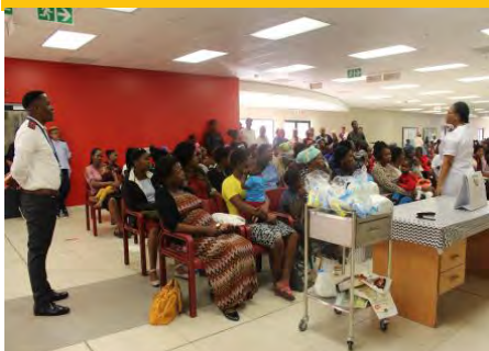
BREASTFEEDING WEEK READ MORE ON PAGE 05