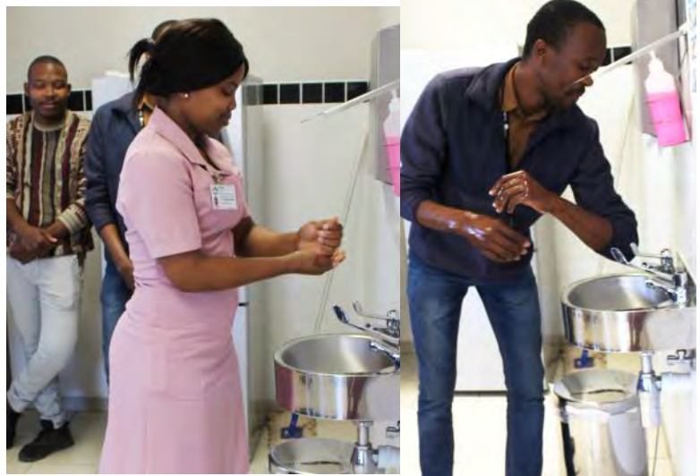
Above : Staff members demonstrating a proper hand washing for health workers.