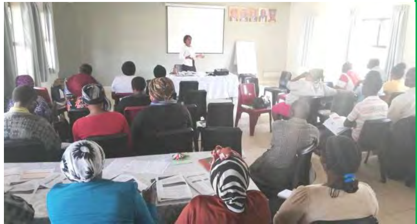
Training on progress ...

C linic committees are health governance structures, created to provide an avenue for communities to give input and feedback into the planning, delivery and organisation of health services and play an oversight role in the development and implementation of health policies and provision of equitable health services. Legislated by the National Health Act of 2003, the committees are made up of a combination of community and civil society representatives and health professionals of each area. They allow community concerns to be elevated through the structures from local to district to provincial and finally to national level. On the 5th –8th of August 2019, Othobothini CHC managed to train all five PHC Facility Government structures following the Act provided for the establishment, functions and procedures of hospital boards and primary health care facility.