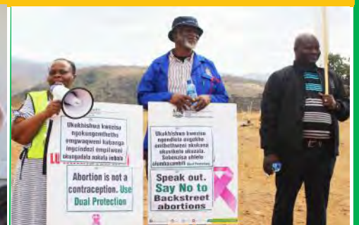
MARCH AGAINST ANTI-BACKSTREET ABORTION READ MORE ON PAGE 06