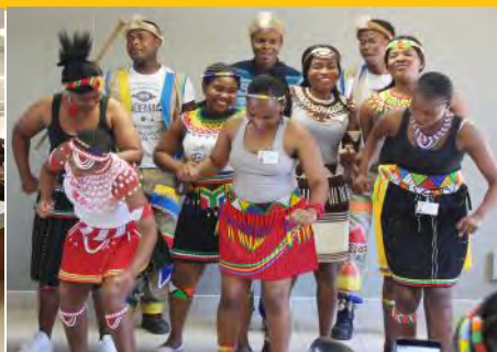
HERITAGE DAY READ MORE ON PAGE 04