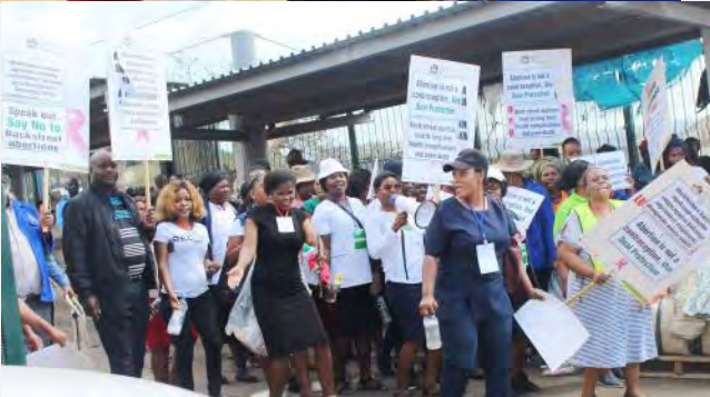
Participants were singing a song encouraging the community members to refrain from illegally aborting around Jozini Taxi rank

The purpose was to caution the community about the dangers of doing termination of pregnancy without consulting healthcare facilities.