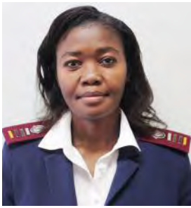
N.N Mdlletshe ANM- MCWH