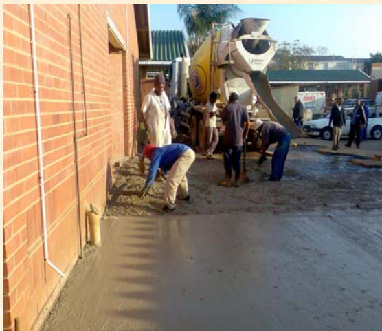
Waiting Area for Dental Patients is under construction