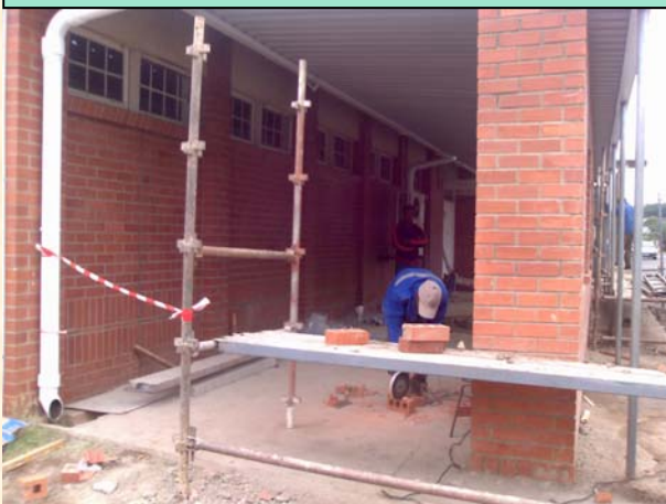
Construction of Psychiatric patients Waiting Area