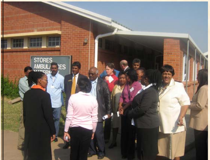
PARLIAMENTARY MEMBERS ,LOCAL COUNCILLORS FROM DEMOCRATIC ALLIANCE AND THE MANAGEMENT DURING THE SIGHT SEEING TOUR WITHIN THE FACILITY