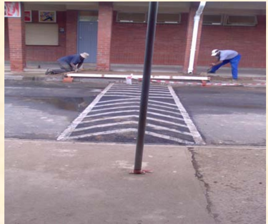
Speed humps and Access ramps for physically challenged patients