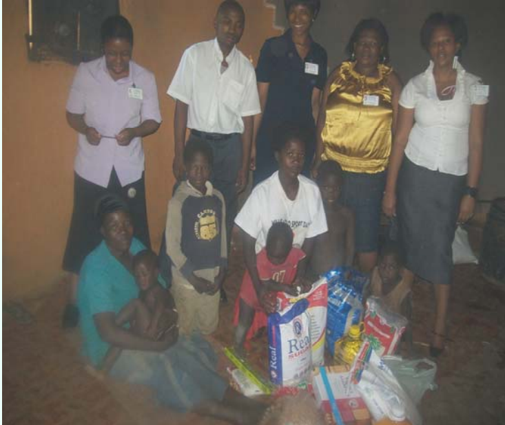
Pholela Staff giving groceries to the family