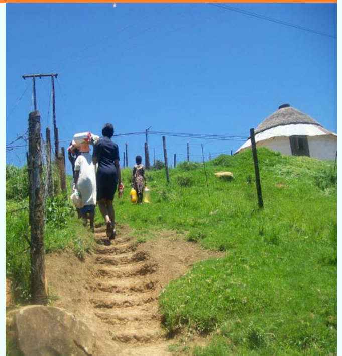
Pholela Staff climbing mountains to help

uMnyango Wezempilo . Departement van Gesondheid