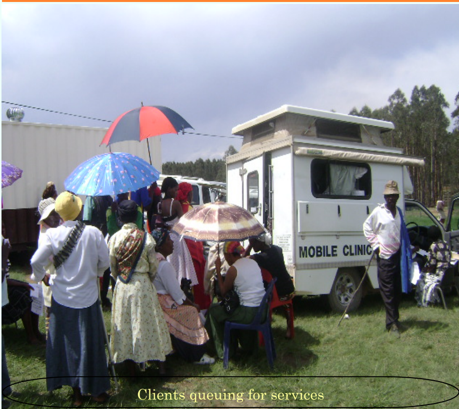
Clients queuing for services

VCT, TB, Dental Services, Eye Care, Cervical and Prostate screening, Basic