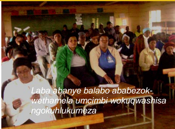
Labo abanye balabo ababezokwethamela umcimbi wokuqwashisa ngokuhlukumeza