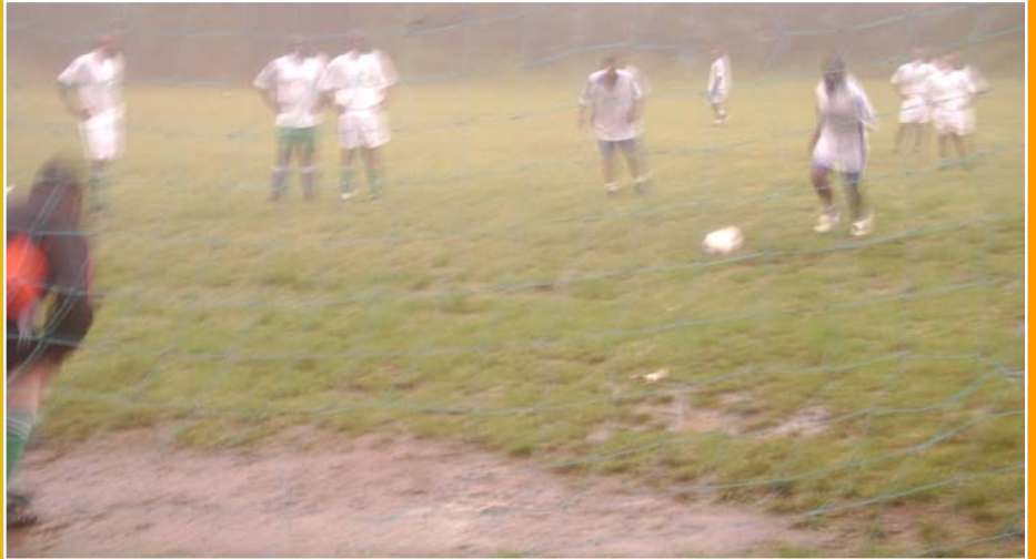
In the goals is Nhlanhla Dlamini trying to stop a penalty that ended up in a goal.

Both teams were expected to bring along net ball team so as to have a enough fun. Unfortunately weather conditions were not conducive enough and there for girls could not play. Eventually Pholela CHC won 4 goals to 2.