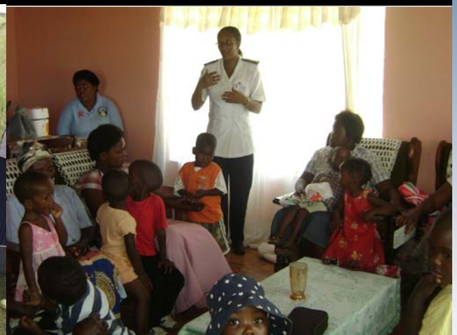
Lapha u Sr Mokapela ubenikeza u Health Education ngaphambi kokuqala komgomo endaweni yase Nkumba