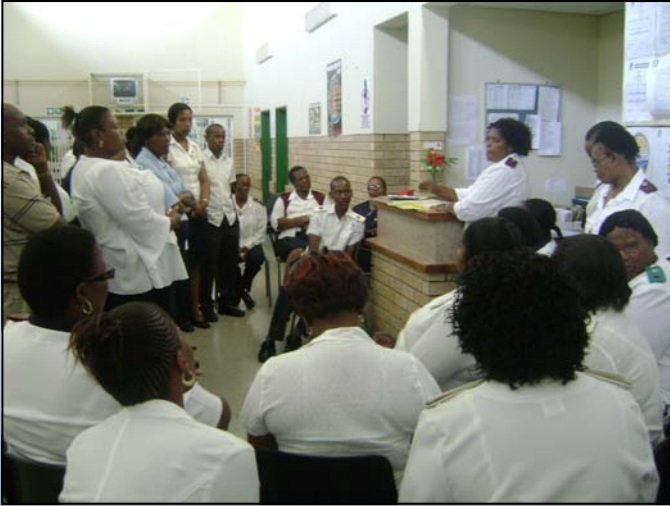
Sithe zisuka nje ngo January 2008 iPholela CHC yenza imikhankaso ka Batho Pele ukuze bonke abasebenzi bayiqonde lemigomo.