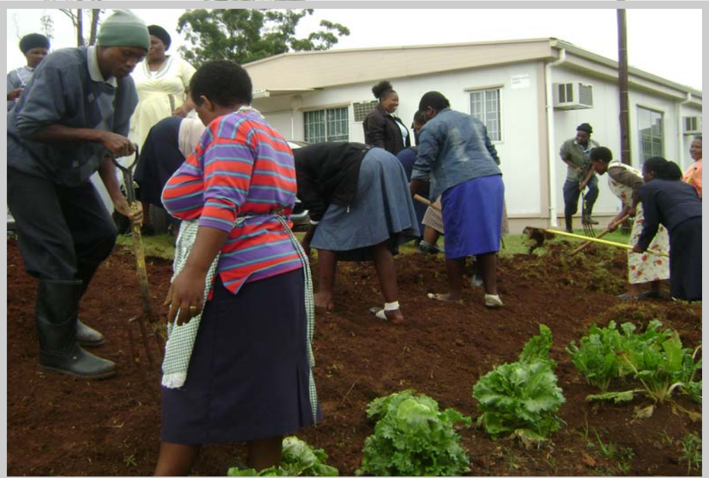
Above Community health workers taking care of demo Garden