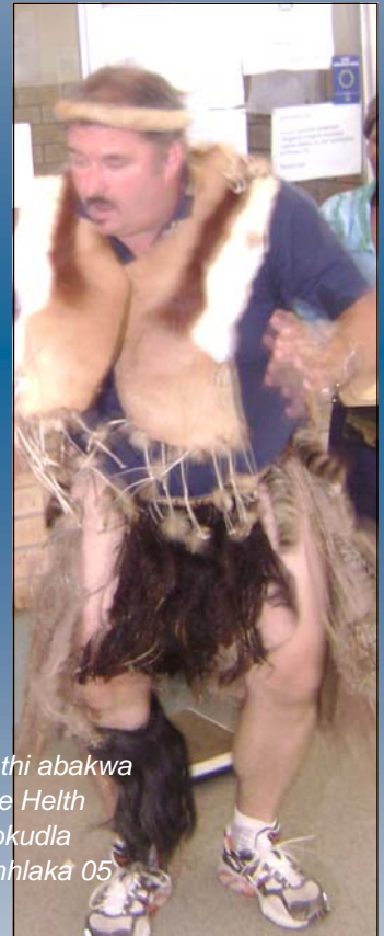
uShoba lembuzi ngesikhathi abakwa Environment base Sisonke Helth District bezoqwashisa ngokudla ukudla okunomsoco ngomhlaka 05 February 2008.