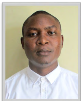
LW Cele Enrolled Nursing Assistant