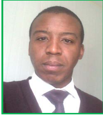
Sifiso Mkhize WRITER/DESIGNER/PHOTOGRAPHER