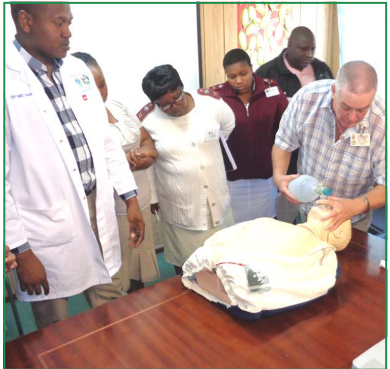
Resuscitation Orientation and Induction