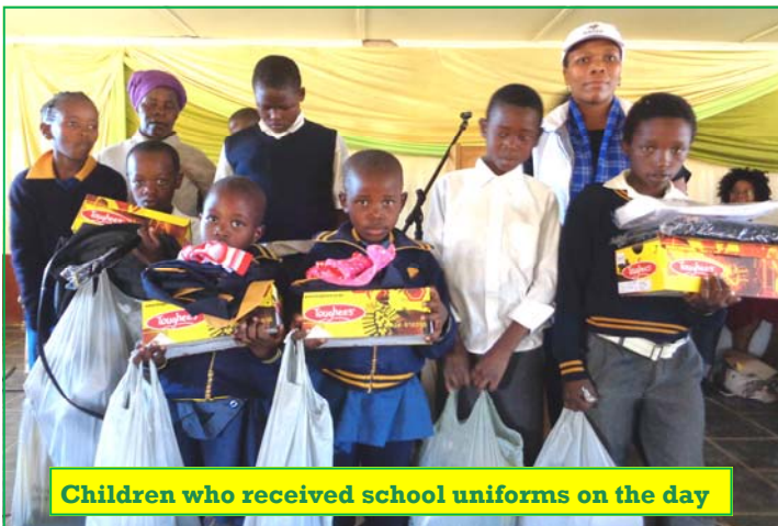
Children who received school uniforms on the day

This initiative should be taken into account by all schools as this help with the development of the school and with the learners as well. Its evident that Nkelabantwana children have a bright future ahead of them. Thanks to all the Government Departments and officials who support this .