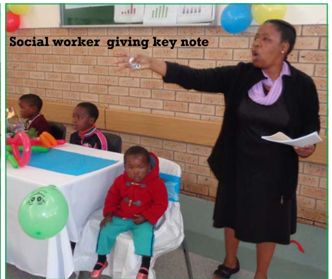
Social worker giving key note

C hild protection week took place at the OPD Section and was attended by staff, community and children who were at the clinic on the day. The theme behind this event was “Children are the Future of tomorrow”