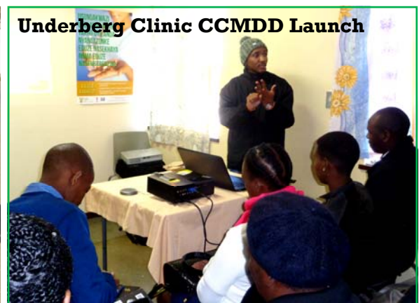
Underberg Clinic CCMDD Launch