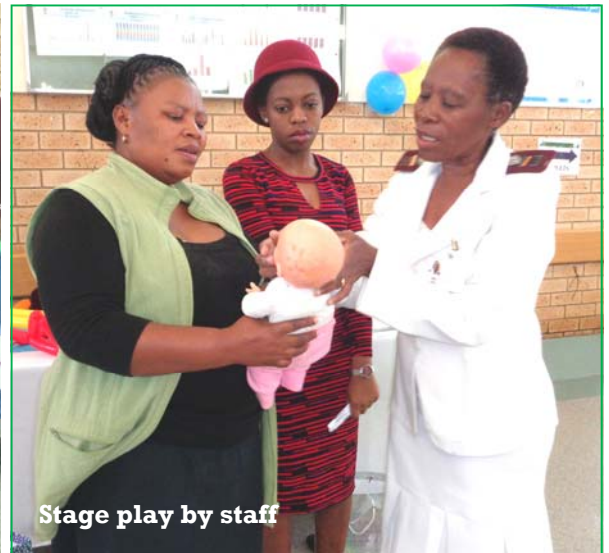
Stage play by staff