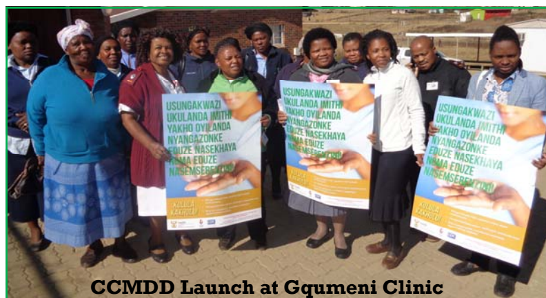
CCMDD Launch at Gqumeni Clinic