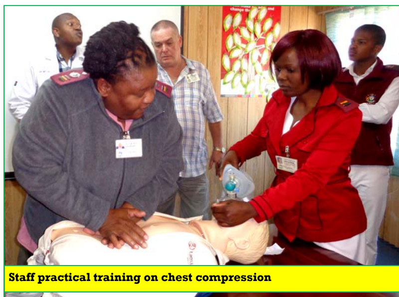
Staff practical training on chest compression

The nurses were reminded on the principles of Resuscitation, including practical training on bagging and chest compressions. This new machine will be introduced to all public places such as Malls, airports and health institutions.