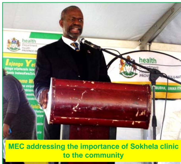
MEC addressing the importance of Sokhela clinic to the community