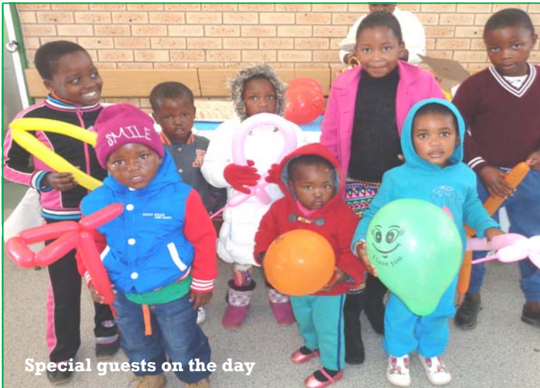
Special guests on the day