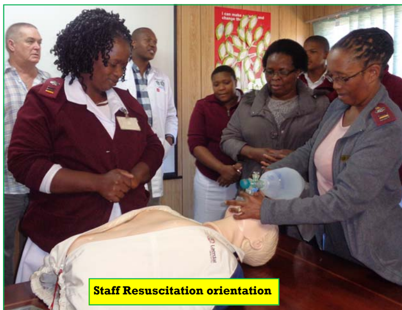
Staff Resuscitation orientation