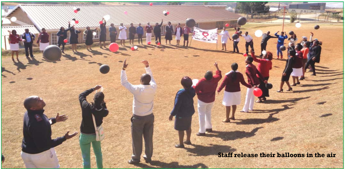
Staff release their balloons in the air