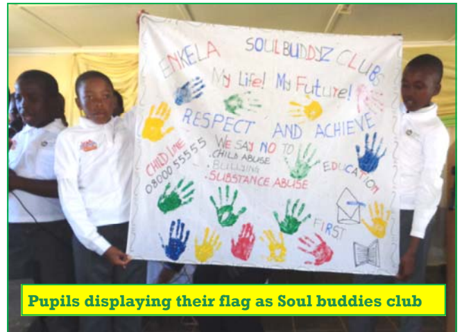
Pupils displaying their flag as Soul buddies club