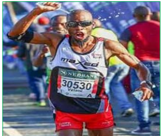
Comrades Marathon 2016 READ MORE ON PAGE 03