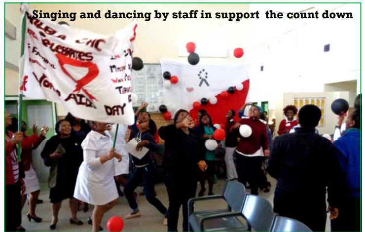
Singing and dancing by staff in support the count down

South Africa will be hosting the 21st International Aids Conference in Durban from the 18-22 July 2016. The theme for this year: “Access Equity Rights Now” is a call to action to everyone by the Deputy President of the country, that we need to work together to support and take care of people who still lack access to comprehensive treatment.