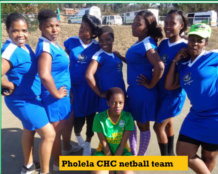
Pholela CHC netball team