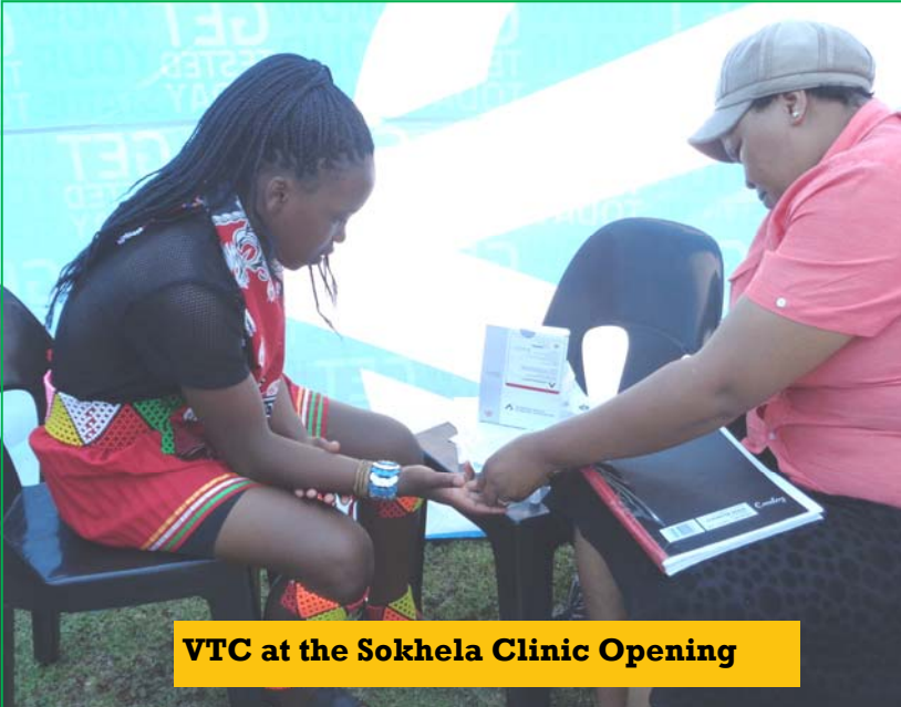
VTC at the Sokhela Clinic Opening