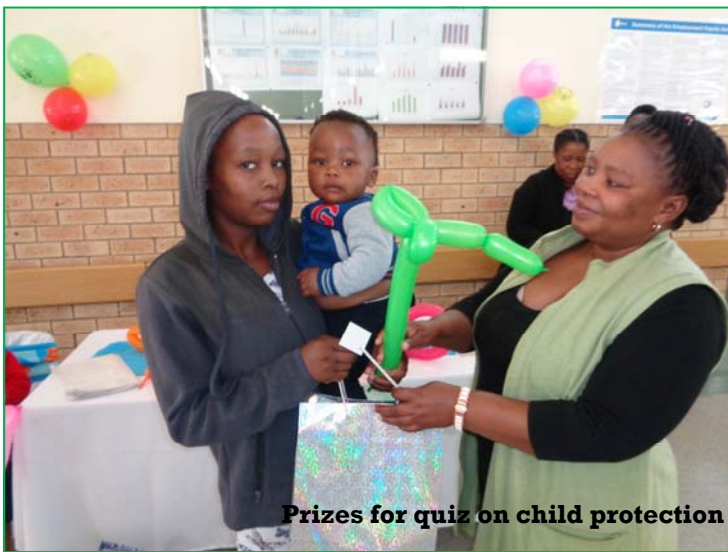
Prizes for quiz on child protection