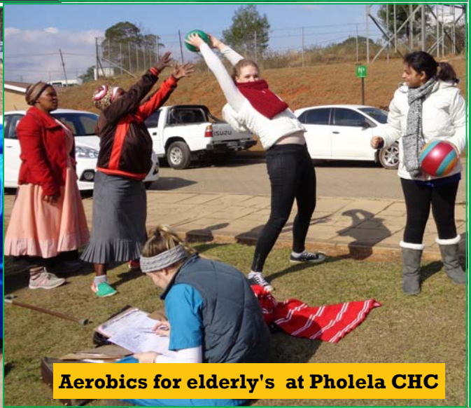
Aerobics for elderly's at Pholela CHC