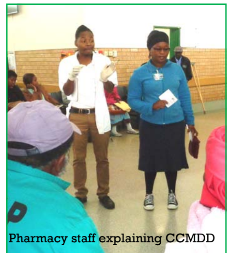
Pharmacy staff explaining CCMDD