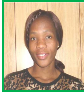
Zinhle Hlongwane WRITER/PHOTOGRAPHER