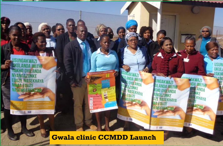
Gwala clinic CCMDD Launch