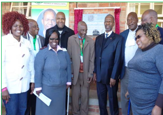
MEC at Sokhela Clinic READ MORE ON PAGE 09