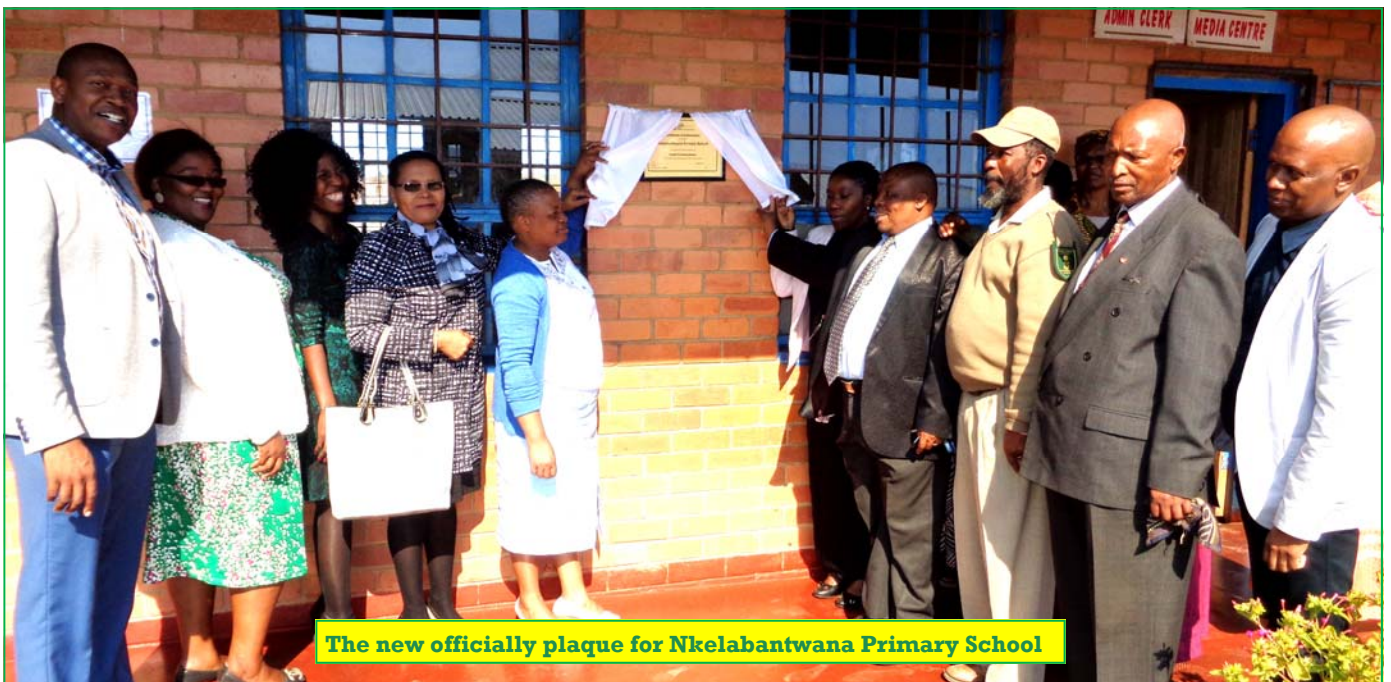
The new officially plaque for Nkelabantwana Primary School