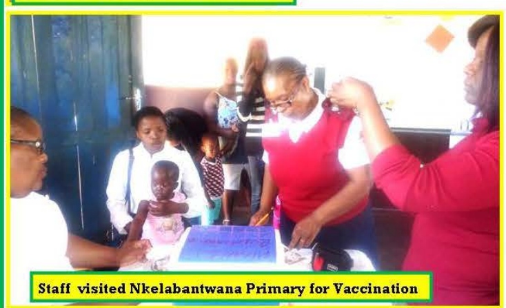
Measles Vaccination at Bethlehem

On the 21st of June we visited Nkelabantwana Primary School along with CCG's and the outreach team. The immunization went well as all mothers and children came out to the school. During this campaign various things were also done like deworming, Muac and giving of vitamin A.