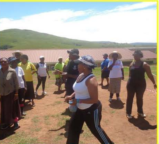
Wellness Day Pholela CHC staff and Community