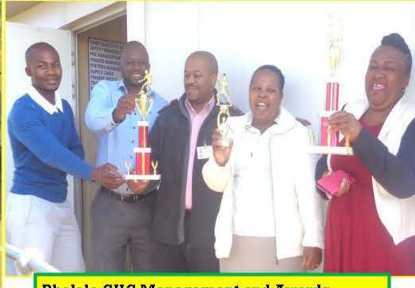
Pholela CHC Management and Awards