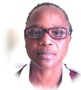
TR Zulu Enrolled Nurse