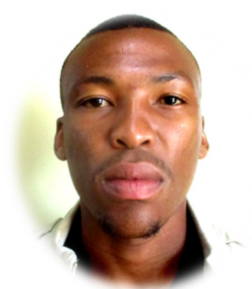
NB Zondi Public Relations Trainee