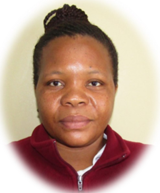
ZN Gcabashe Enrolled Nurse