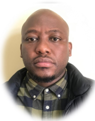
N Duma Data Capturer