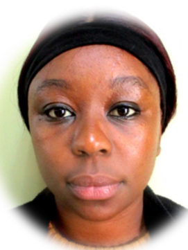
TB Cooper Human Resource