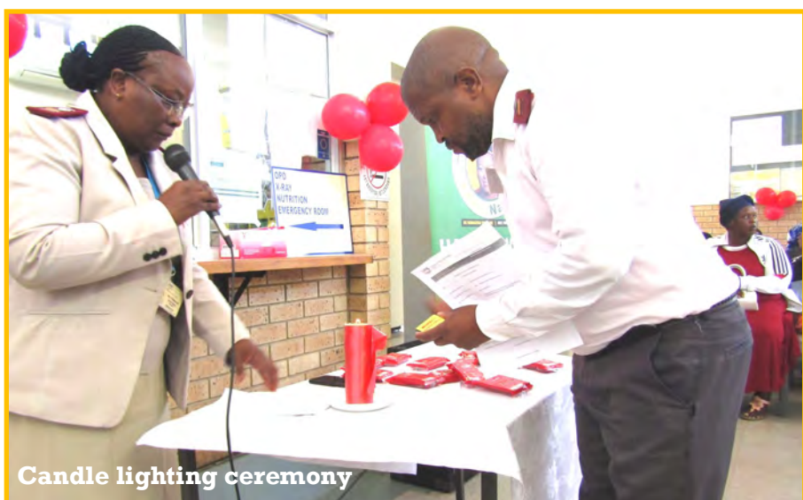
Candle lighting ceremony