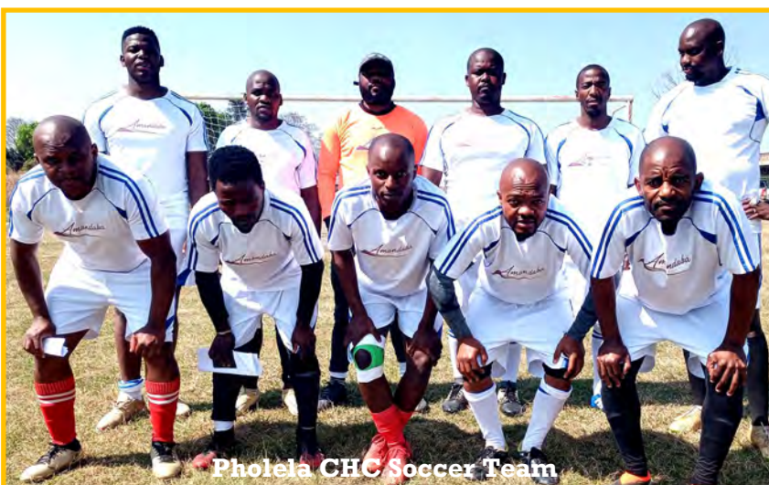
Pholela CHC Soccer Team