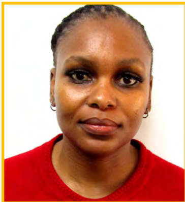
NN Ngcobo SCM Intern