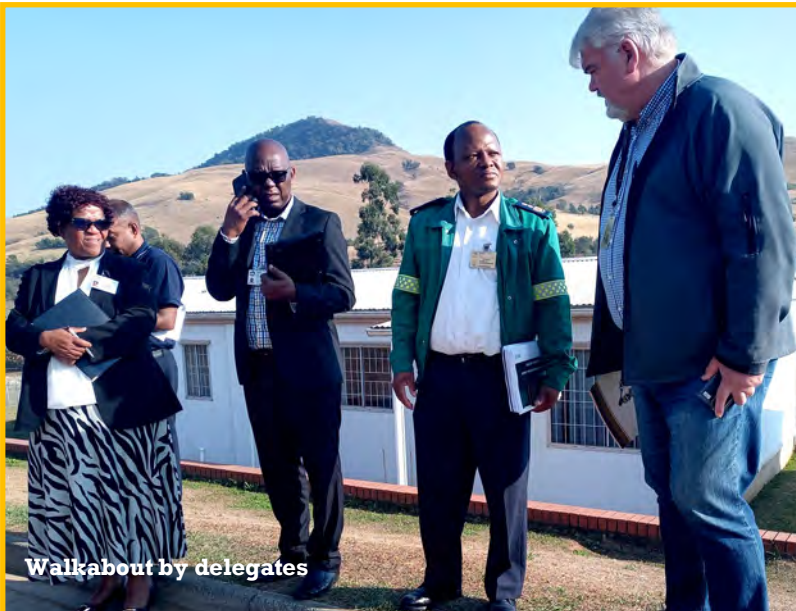
Walkabout by delegates

The KZN Legislature Team advised the members of the committee, that the findings presented will be taken to the higher forum to be discussed and considered taking into account the report presented to them.