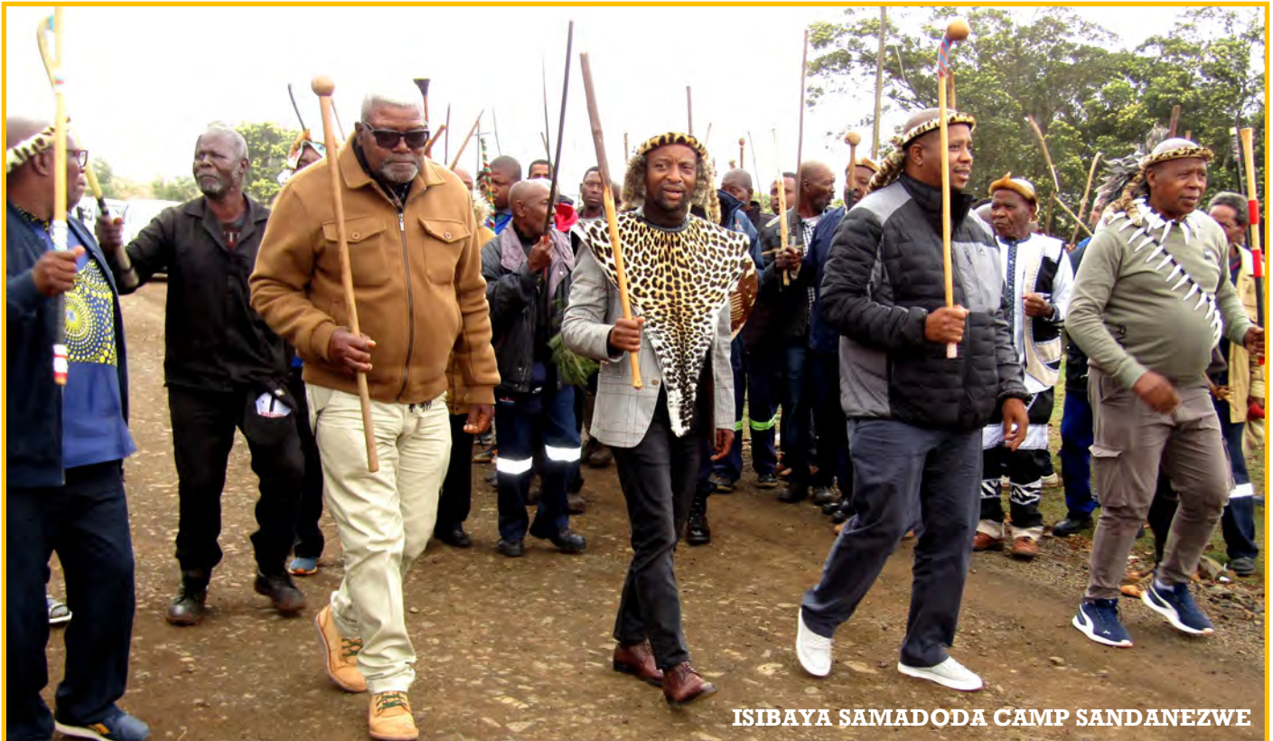
ISIBAYA SAMADODA CAMP SANDANEZWE