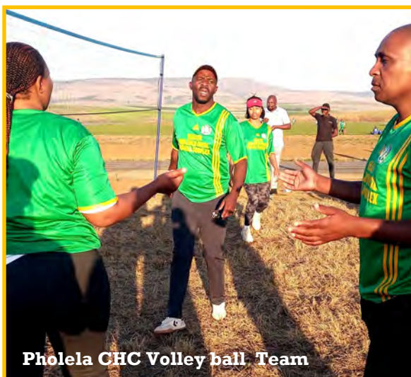
Pholela CHC Volley ball Team

An award ceremony was conducted and all winners received trophies and medals for their hard work and contributions. Staff engaged and socialized with each other during the braai and this was an amazing way for all staff to know each other outside of work environment.