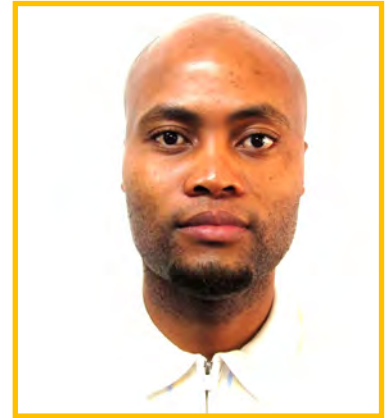
MN Biyase SCM Intern