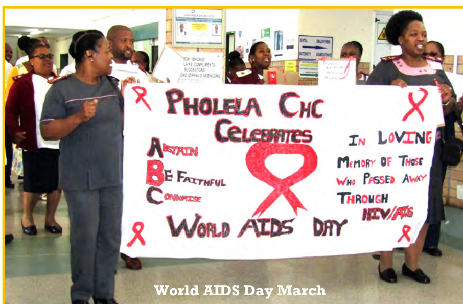
World AIDS Day March