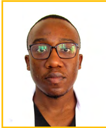
A Mncwango Pharmacist Comm-serve