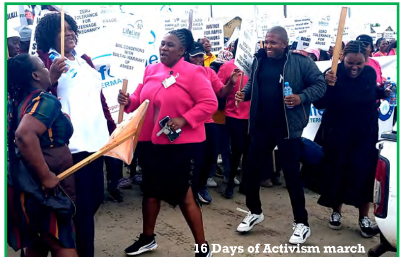
16 Days of Activism march