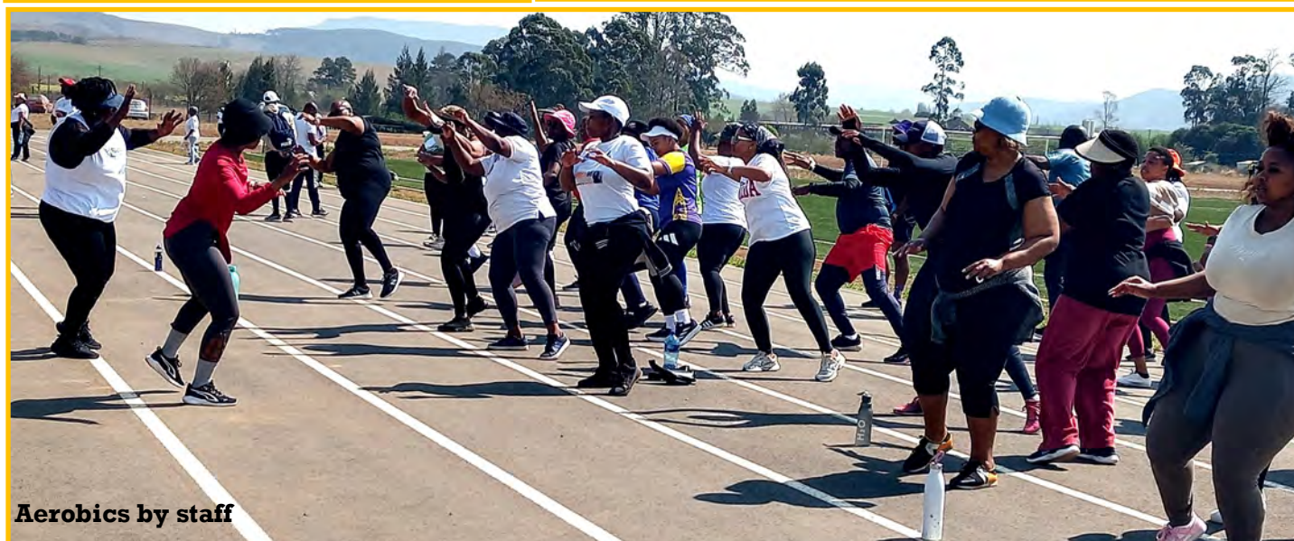
Aerobics by staff