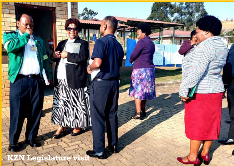
KZN Legislature visit

The KZN Legislature visited various EMS Bases in and around KZN as part of the Health Institution Facility Monitoring Programme, to perform an oversight in order to address all the challenges faced by the Emergency Medical Service (EMS)