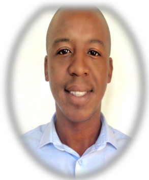
Sifiso Mkhize WRITER/DESIGNER PHOTOGRAPHER