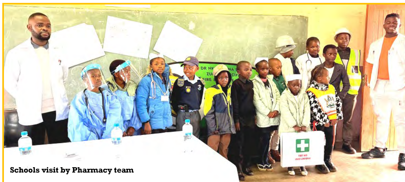
Schools visit by Pharmacy team

Donations of sanitary pads to female patients and other donation from Superspar Underberg were shared with all the children during the awareness campaign.