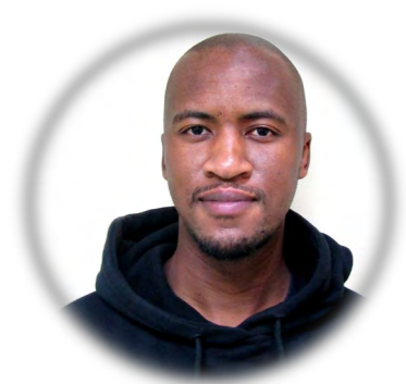
SP Sibeko Chief Radiographer Writer/editor