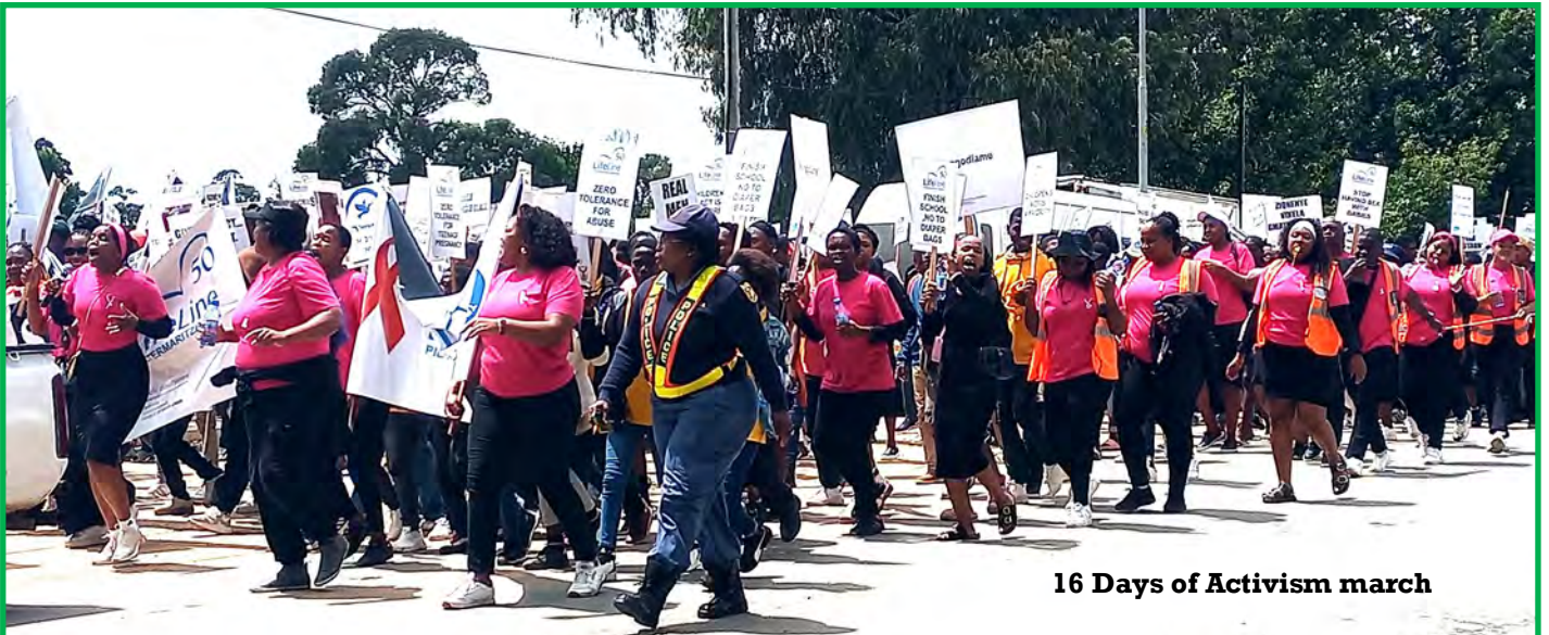
16 Days of Activism march