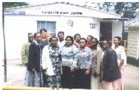
EN Group receiving certificates:

also wishing the Management, Nursing Staff and all students a prosperous new year.