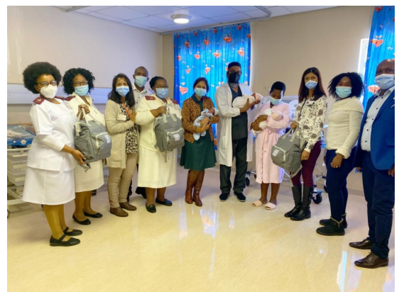
Management and doctors team happy for the successful delivery of triptels. Mother was given gifts for her babies

A 25 year old first time mom was blessed with triplets in June 2021 from Mseleni successfully delivered her triplets at QNRH. She delivered via caesarean two baby girls and one boy. She said she was informed at during her antenatal care visits that she was pregnant for triplets. She thanked the team of doctors and nurses who assisted her.