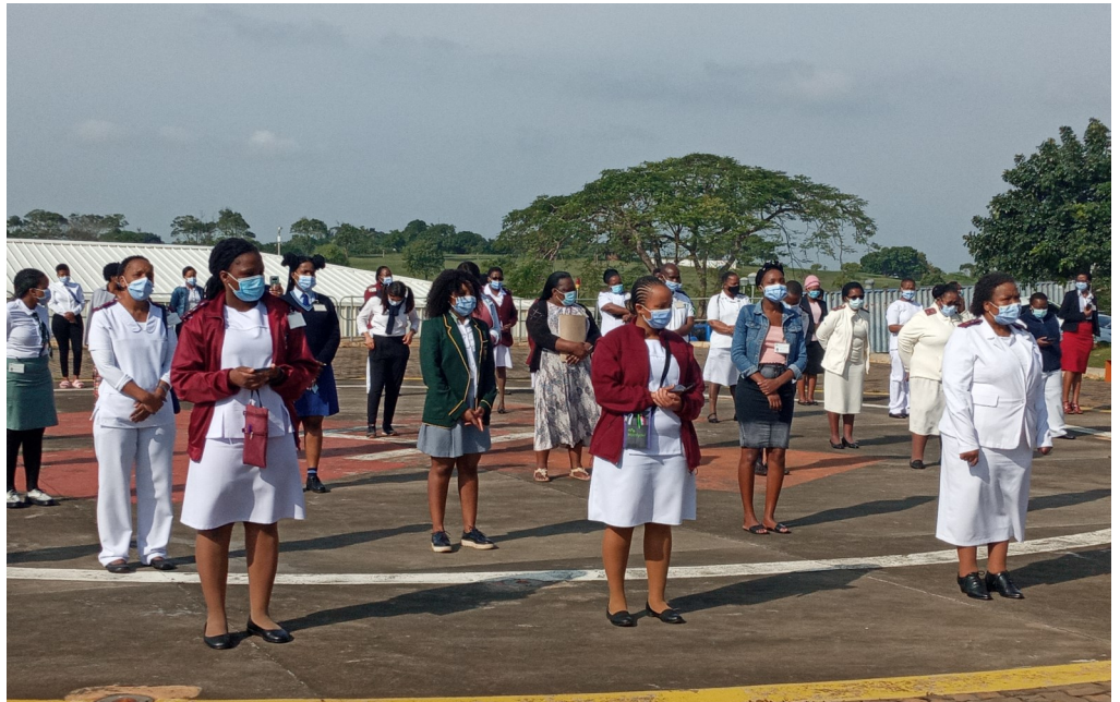
QNRH staff members during the prayer session on the Youth Day listening to the motivation by the District Chaplain