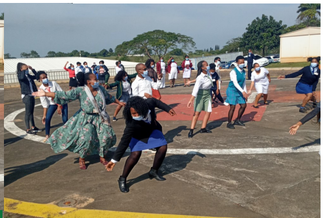
It was so distressing and calming as dancers were enjoying themselves and feeling move.