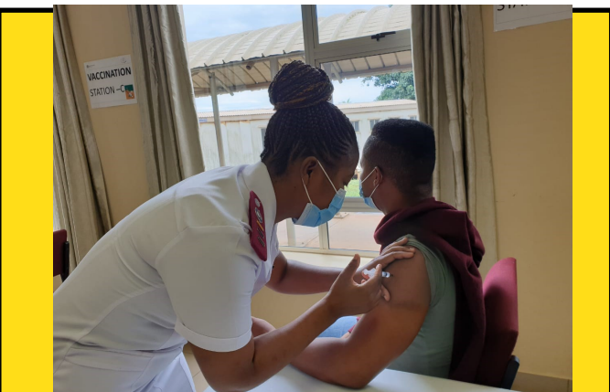
Client receiving his jab