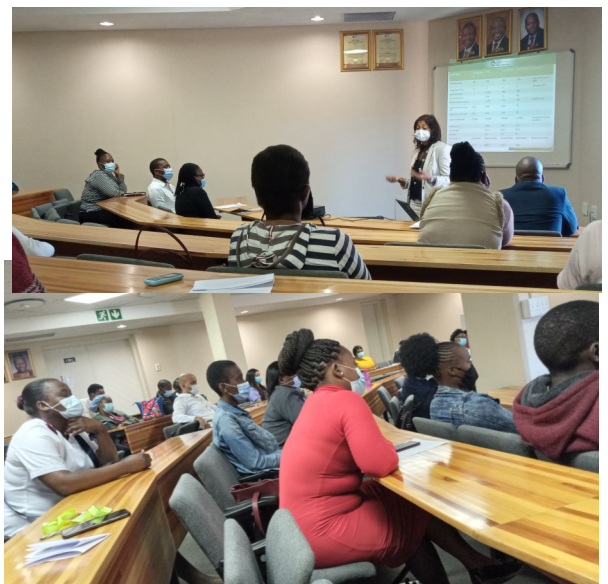
Newly employed staff listening to the Acting CEO during their orientation and induction programme.

induction workshop was for all employees who joined QNRH team from the January to March 2021. It was done in the auditorium and all Covid-19 protocols were observed.