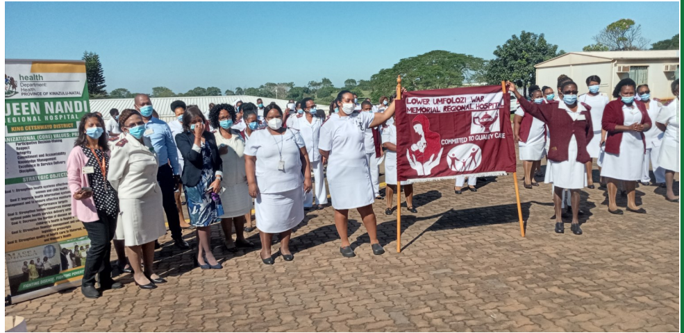
QNRH nurses holding their banner during the Nurses Day 2021