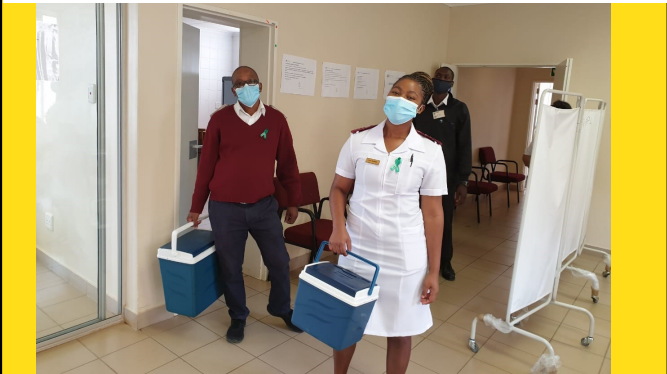
Vaccine arrival at the vaccination center, escorted by the security

Vaccine Clinic team doing the dry-run at Nurse's Home which was to be the vaccination site at QNRH.