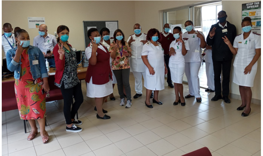
Vaccine site team doing the dry-run at Nurse's Home which was to be the vaccination site at QNRH.