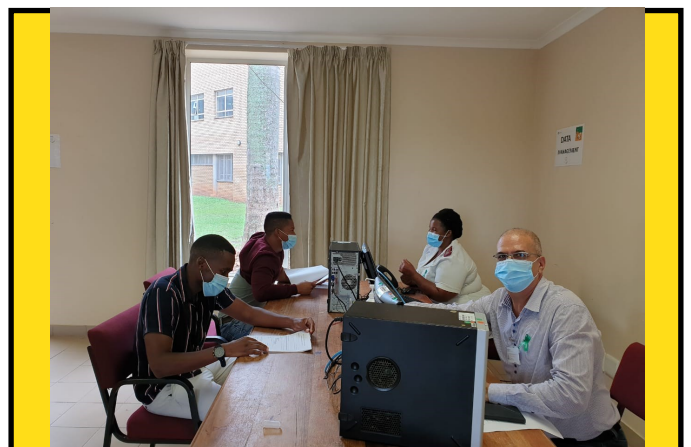
Data management where client's information is recorded