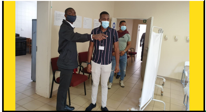
Security welcoming and directing clients coming for vaccination