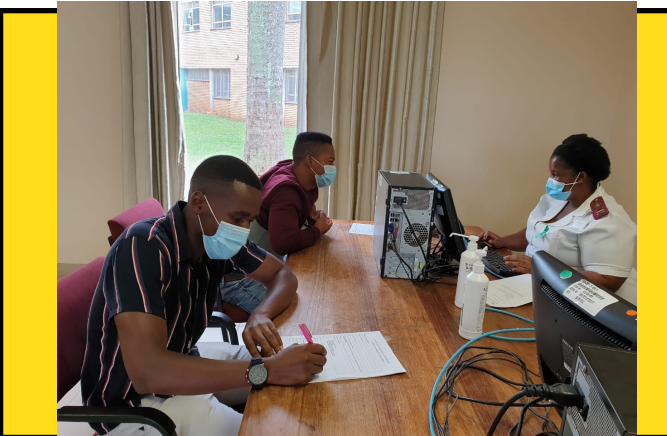
Client filling in screening forms and registration