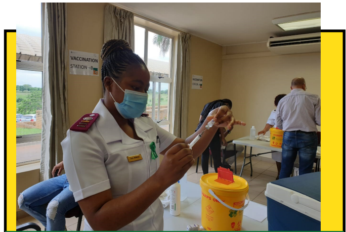
Nurse preparing for the vaccine