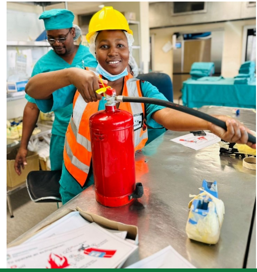
Theatre team in practise for fire fighting