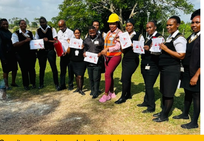
Security services team during the training