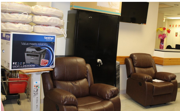
Two couches, cushions and printer donated to oncology unit by HST