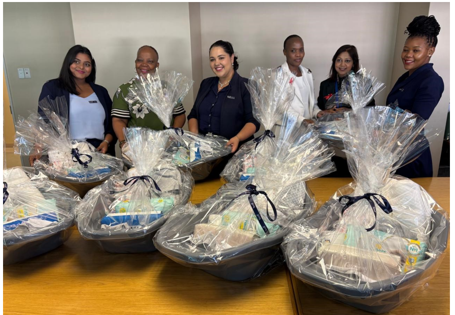
QNRH management receiving hampers from the officials from SEEF

Eight (8) baby hampers donated to the hospital by one of the partners (SEEF). Special thanks to for their ongoing support with baby hampers for Christmas and New Years Babies