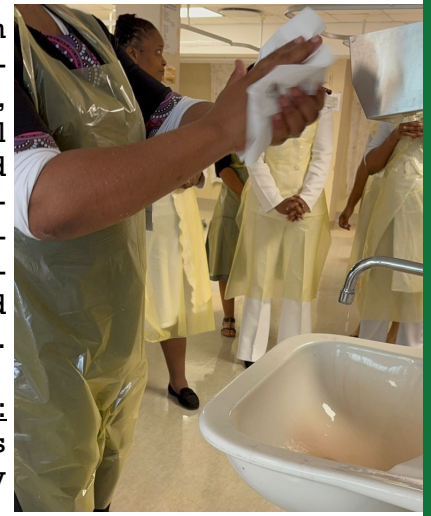
Neonatal Unit staff washing hands in the hand hygiene corner.