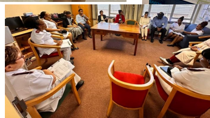
Debriefing after the drill which was indeed a learning opportunity to other team members