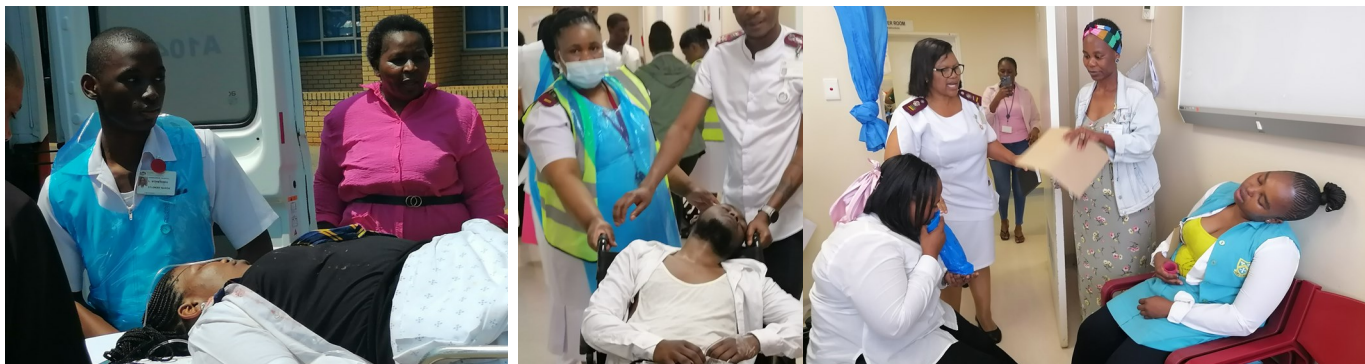
Children with food poisoning arriving at the hospital POPD.

Queen Nandi Regional Hospital conducted its external disaster drill on the 11th of October 2024 in POPD. The drill was about the food poisoning where the hospital had to assess itself if it is ready enough should any sort of disaster happens. The drill was co-ordinated by Health and Safety team in POPD. The idea of food poisoning drill came after the recent outbreak of food poisoning generally in schools and young children.