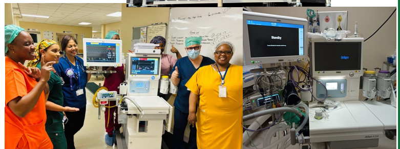
Theatre team receiving Anesthetic machine