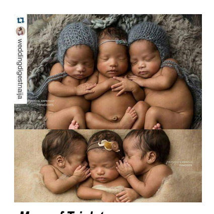
More of Triplets... READ MORE ON PAGE 3