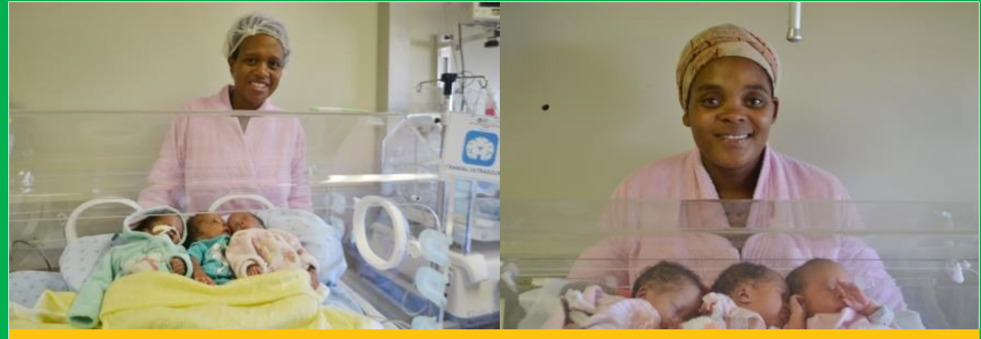
The Queen's Hospital Delivers Queens Of Triplets

Queen Nandi Regional hospital delivered 4 sets of triplets in 2017, 1 in January, 1 February, 1 in March and 1 in October, but in 2018 we have seen an