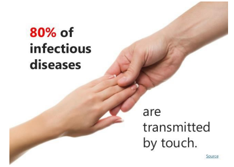
LU Oncology Services Functioning... READ MORE ON PAGE 2