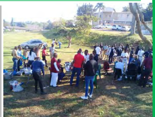
Men's Day Celebration