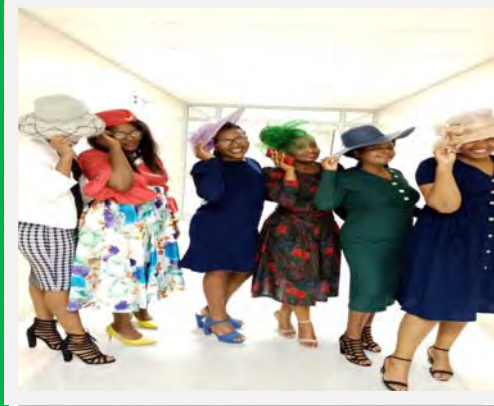
Women's Day Celebration