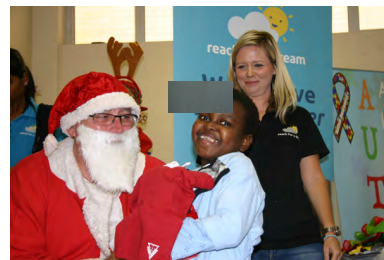
QNRH Celebrating People with Disability Day