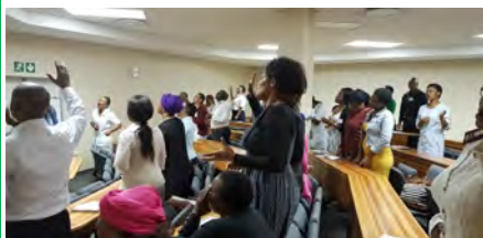
QNRH Ebenezer Service