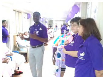
QNRH Prem Awareness Day