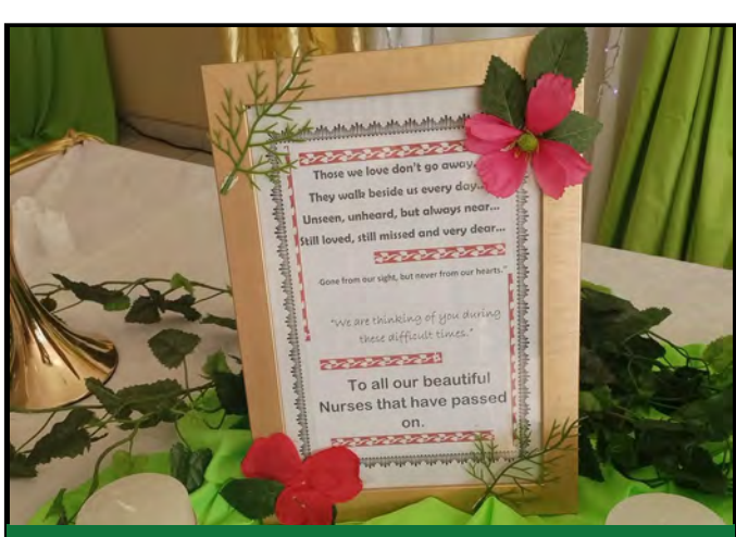
The Nurses Pledge was recited as part of the programme of Nurses Day