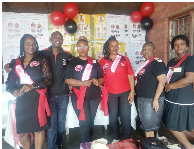
Chronic Clinic commemorated World TB Day