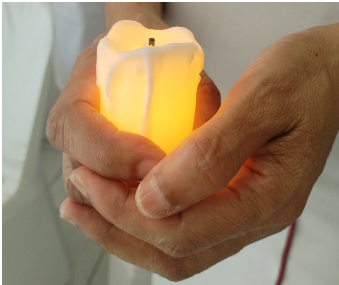
A candle lighting ceremony was observed at Nurses Day in remembrance of nurses who had passed on.