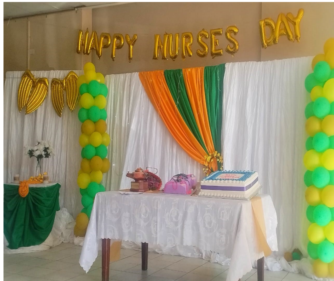
The décor set the tone for the celebration of Nurses Day