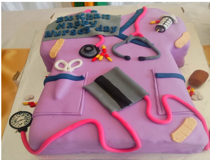
An event is not complete without cake!