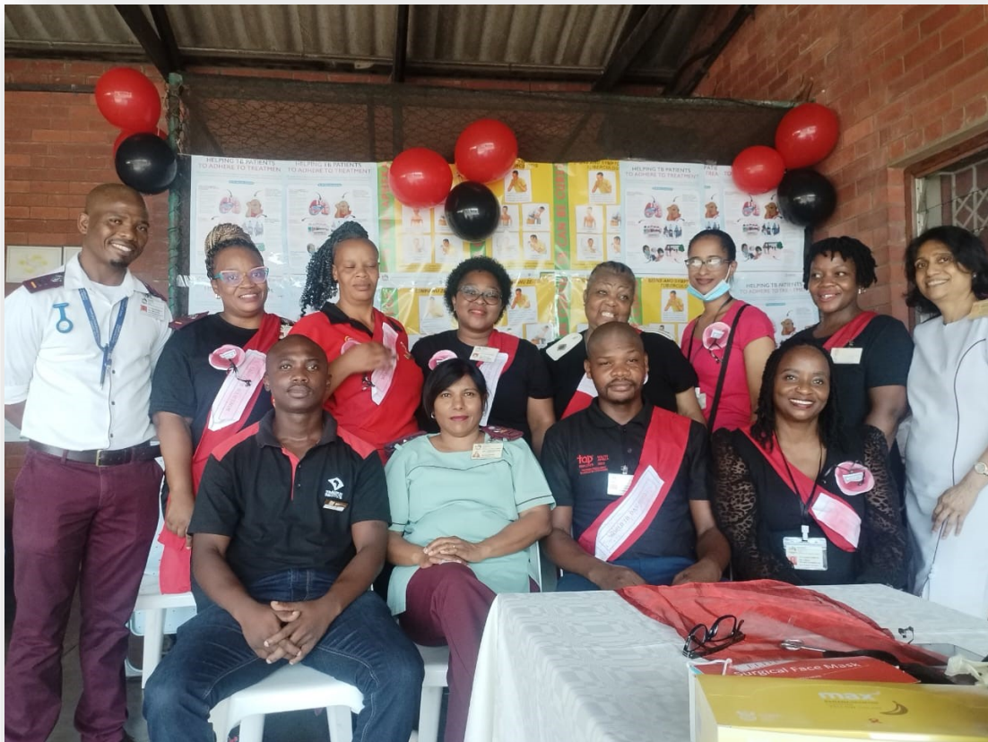
Outreach Clinic together with OPD bringing awareness to patients on World TB Day

Each year we commemorate World TB Day on 24 March to raise public awareness about the devastating health, social and economic impact of tuberculosis (TB) and urge all healthcare workers to accelerate efforts to end this global epidemic. Despite significant progress over the last decades, TB continues to be one of the top infectious killer worldwide.