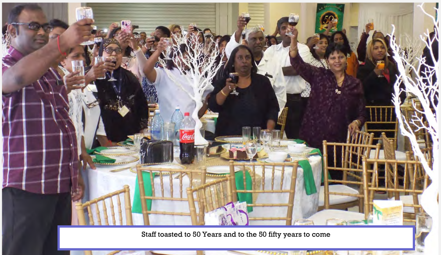
Staff toasted to 50 Years and to the 50 fifty years to come

This event has brought back staff morale and unity amongst staff and I believe all are geared up to