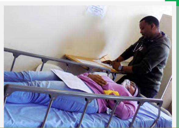
Doctors ensured that each patient was attended to timeously

The drill was found to be effective and showed that all the departments were aware of their rolls and responsibilities and executed them as expected. There were gaps identified which allowed the relevant stakeholder to make the necessary improvements.