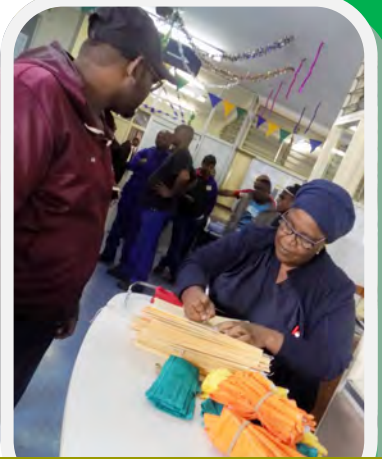
Rapid triaging of patients by sisters

Patients were triaged and attended to immediately. There were 31 green codes, 19 yellow codes and 2 red codes. All patients were attended to by 13h15.