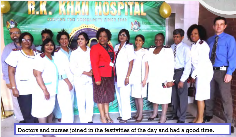
Doctors and nurses joined in the festivities of the day and had a good time.