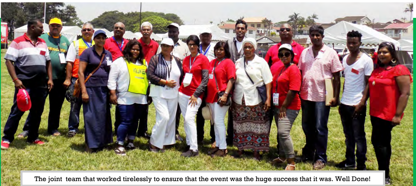
The joint team that worked tirelessly to ensure that the event was the huge success that it was. Well Done!