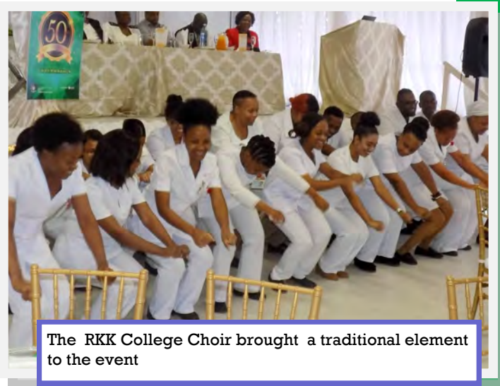
The RKK College Choir brought a traditional element to the event