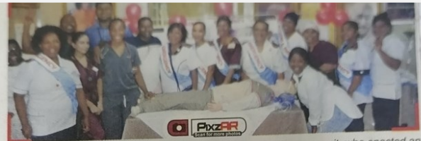
Staff from the outpatient department and the emergency and trauma unit, who enacted an entertaining display of emergency scenarios as part of the day's proceedings.