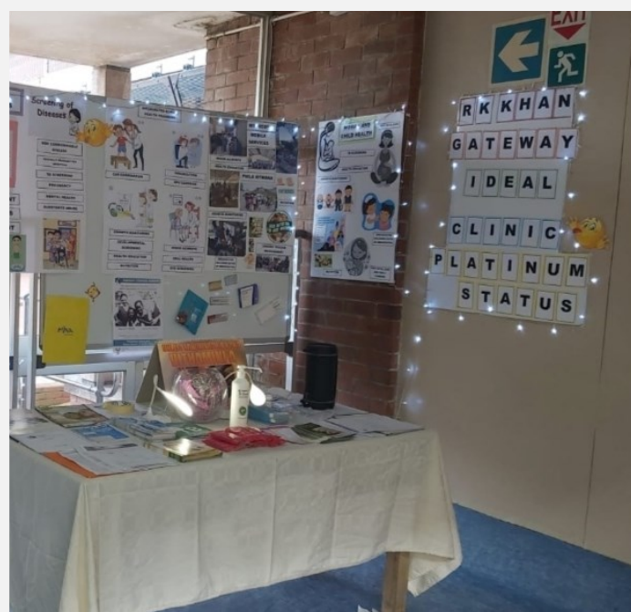
Gateway showing their Ideal Hospital Platinum Status achievement!