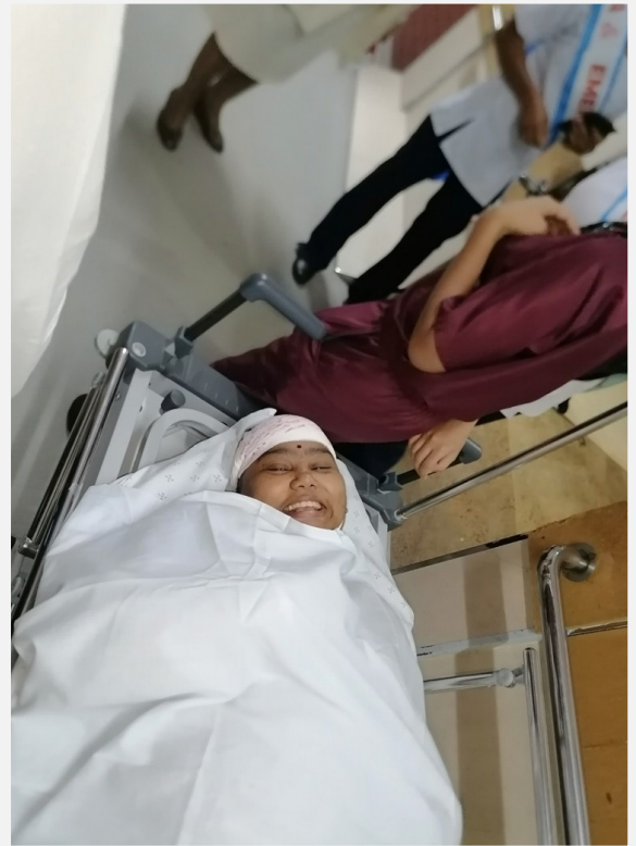
Casualty acting out an emergency scenario on Open Day