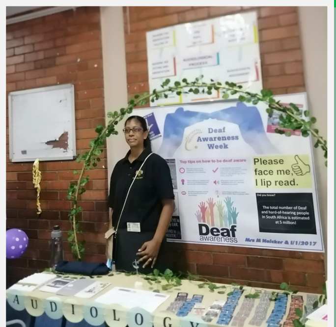
Speech Therapy and Audiology also came out to showcase their services .