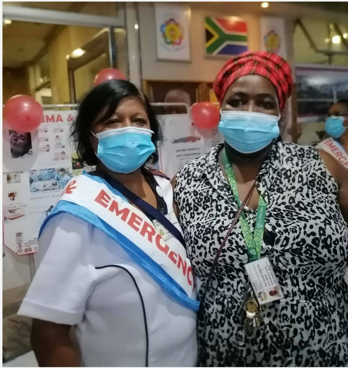
Emergency & Trauma Unit showcased their services during Open Day 2022