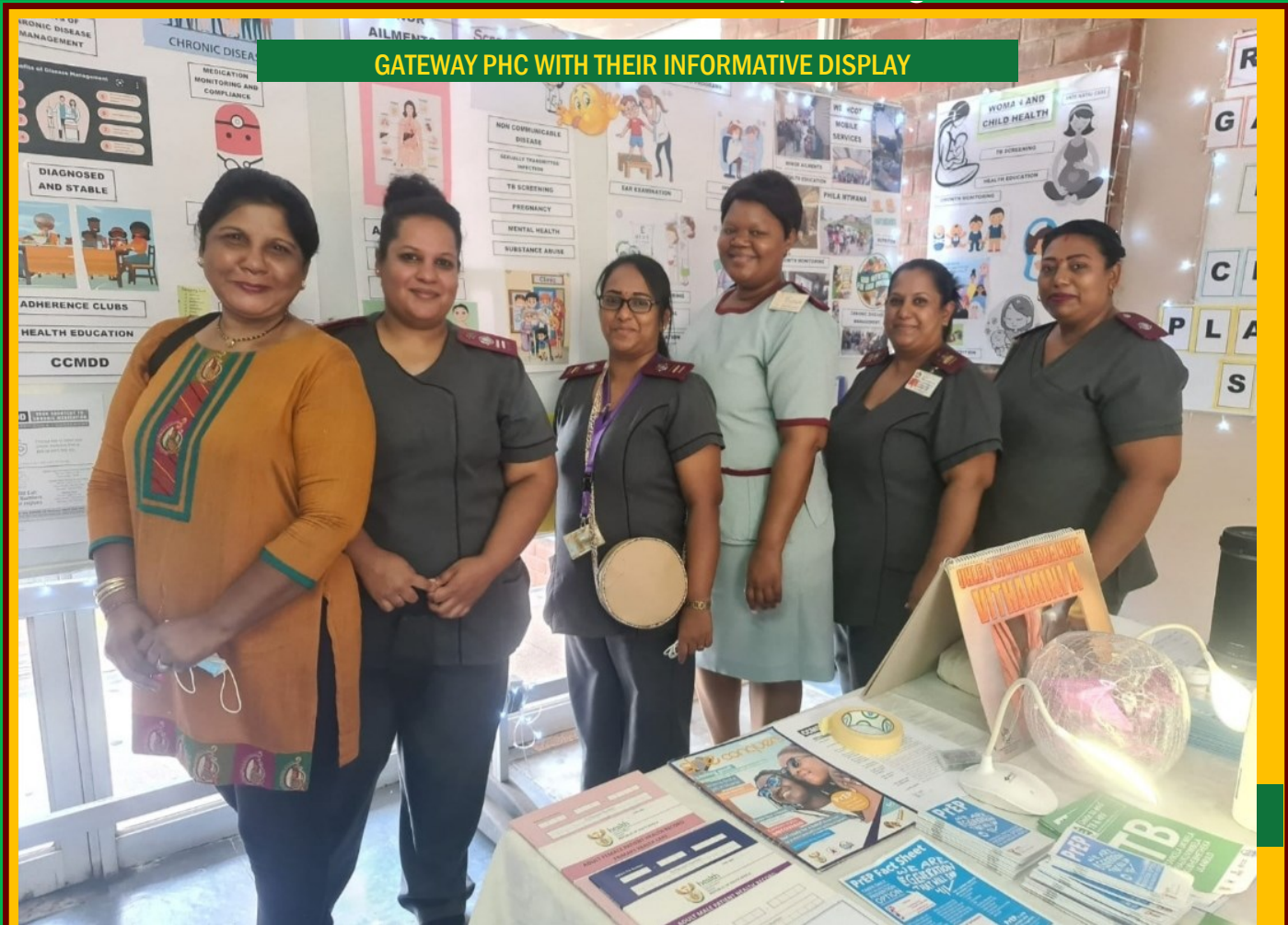
GATEWAY PHC WITH THEIR INFORMATIVE DISPLAY