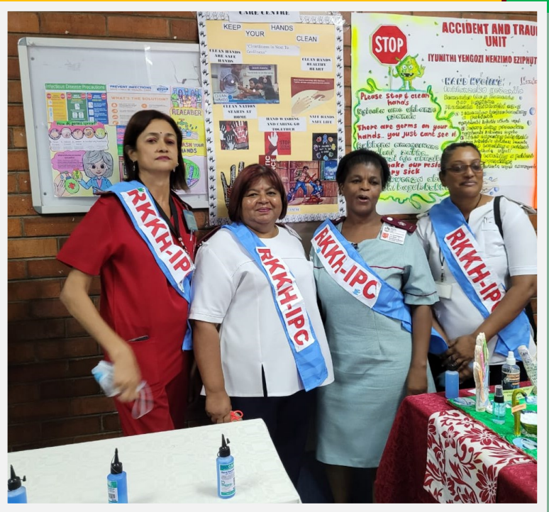
Thuthezela Crisis Centre asked, "are your hands clean?"