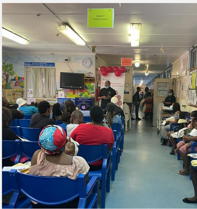
ENT team sharing with mums in POPD on how to identify possible hearing problems in children.