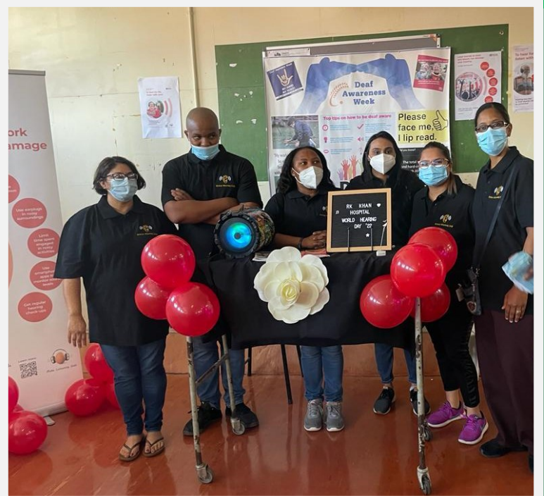
ENT teamed up with Audiology to give advise and ways to prevent hearing loss to patients in OPD.