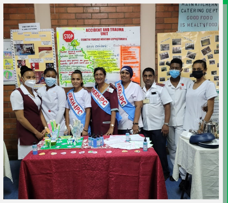
Accident and Trauma unit squashes those germs through hand washing!