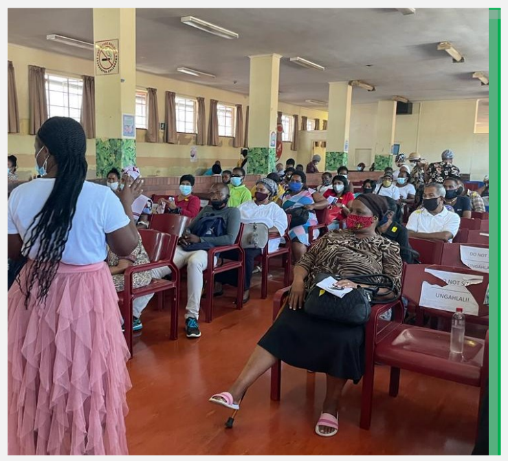
PRO was present to give support and interpret the messages.