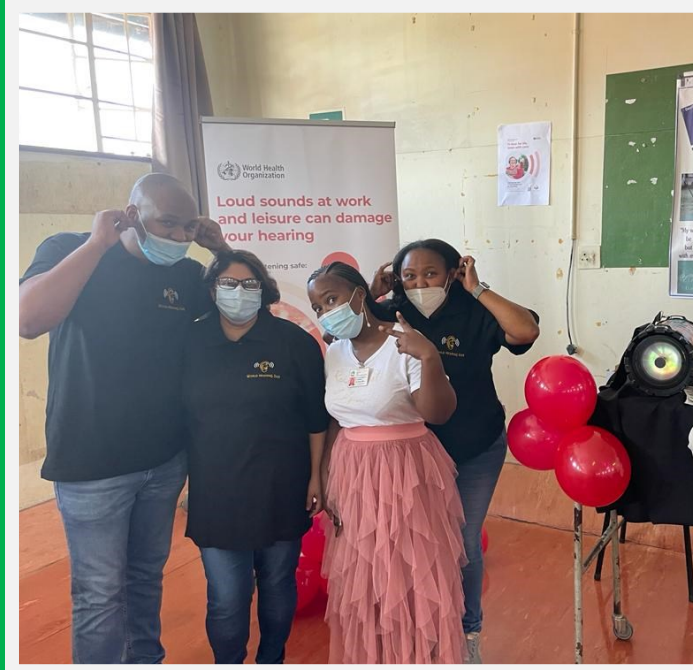
Spreading the message - "to hear for life, listen with care"