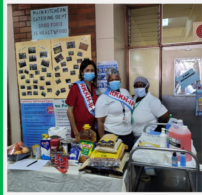
Main Kitchen displaying that food preparation and hand hygiene cannot be separated.