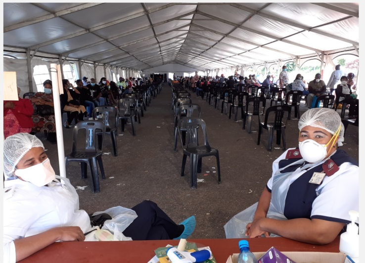
Top: The 1500 seater marquee sponsored by the Chatsworth Youth Centre to manage CCMDD patients . Below: Volunteers from the Youth Centre who assist in crowd control & social distancing .