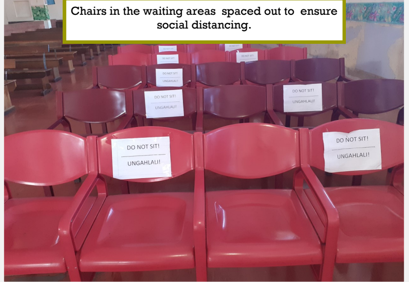
Chairs in the waiting areas spaced out to ensure social distancing.