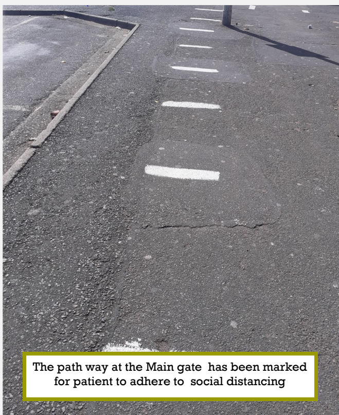
The path way at the Main gate has been marked for patient to adhere to social distancing