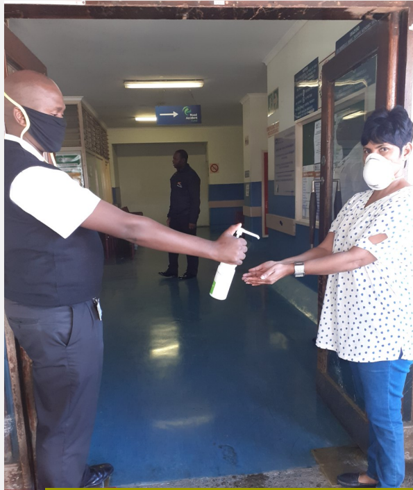
Security guards must spray patients hands at all entry points .