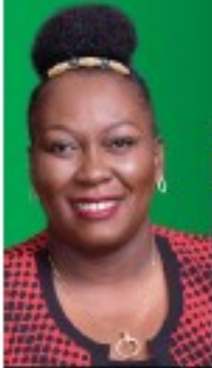
MS NKOMOQOBU MKHELANE-JALI MEC FOR HEALTH

LET'S SUPPORT AND WELCOME HEALTHCARE WORKERS