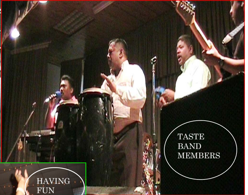
TASTE BAND MEMBERS