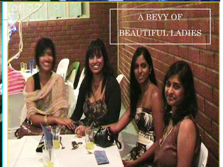
A BEVY OF BEAUTIFUL LADIES