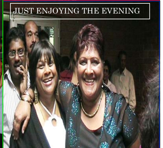
JUST ENJOYING THE EVENING