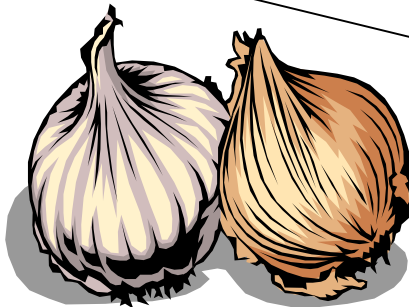
GARLIC MAKES IT GOOD

Tossing a couple of garlic into your cooking is an easy way to get more cancer fighting compound into your diet.