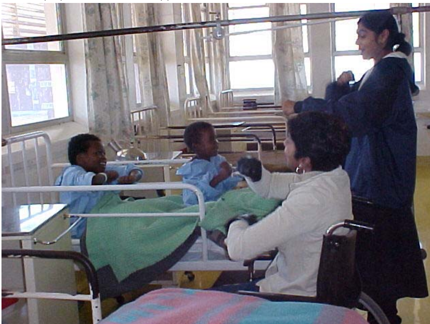
VERUSHKA & JODY AT PLAY WITH ORTHOPAEDIC PATIENTS

The programme involves story - telling through puppets, role - playing, movement and dance, music, art, play and drama therapy.