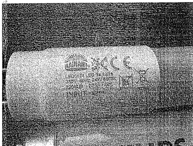
LED 1, 5 meter fluorescent tubes