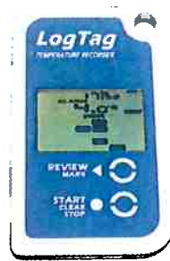
Log Tag® TRID30-7

Fridge tag: is a temperature indicator for refrigerators that shows exposures to temperatures beyond assigned alarm settings. As long as the temperature is within the allowed range, the OK sign is shown on the display. If the indicator is exposed to an out-of-range temperature the ALARM sign appears on the display. The device shows the actual temperature, all alarm violations over the previous 30 days (on a rolling basis), the daily minimum and maximum temperature of the last 30 days, and the time duration of any violation.